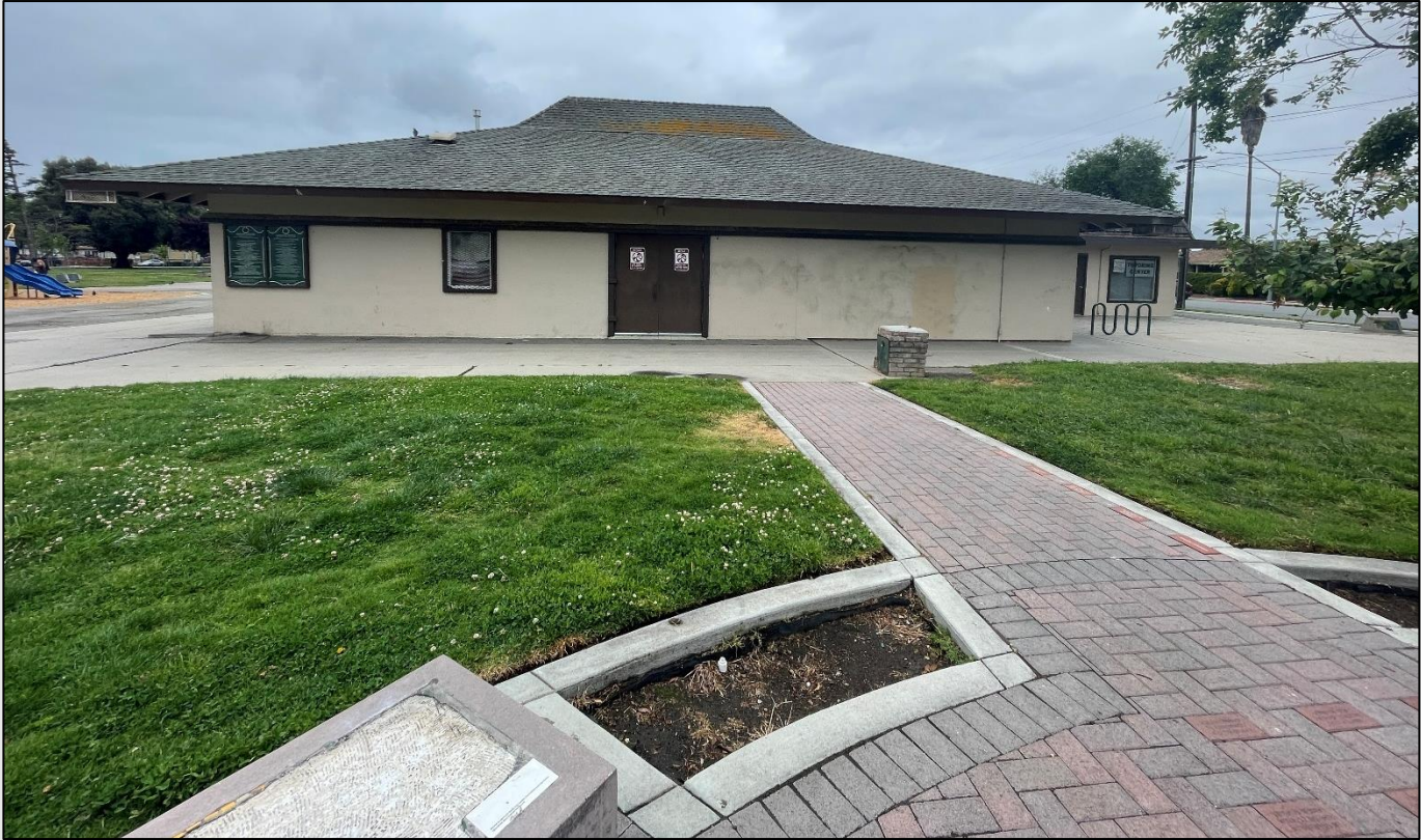
Figure 1 – Closter Park Community Center north building elevation, May 2023.