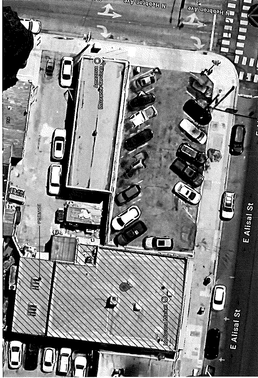
EXISTING SITE LAYOUT