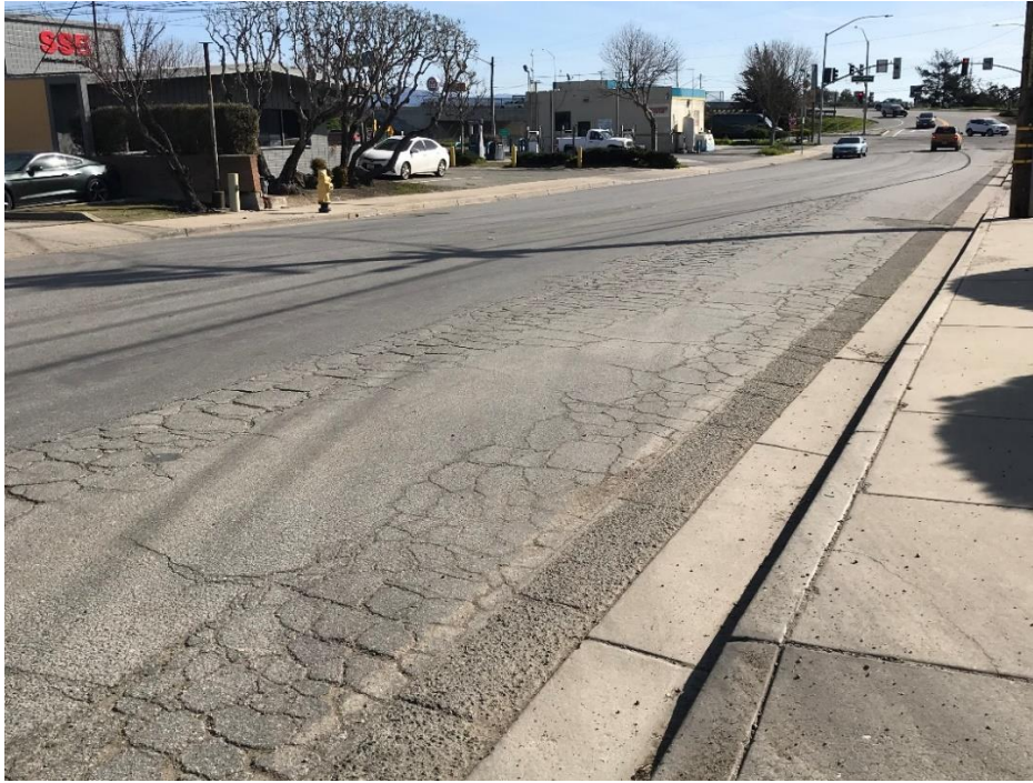
Terven Ave E/O Vertin Ave