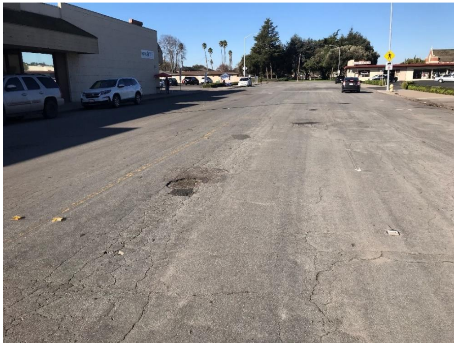
W Romie Ln Westbound