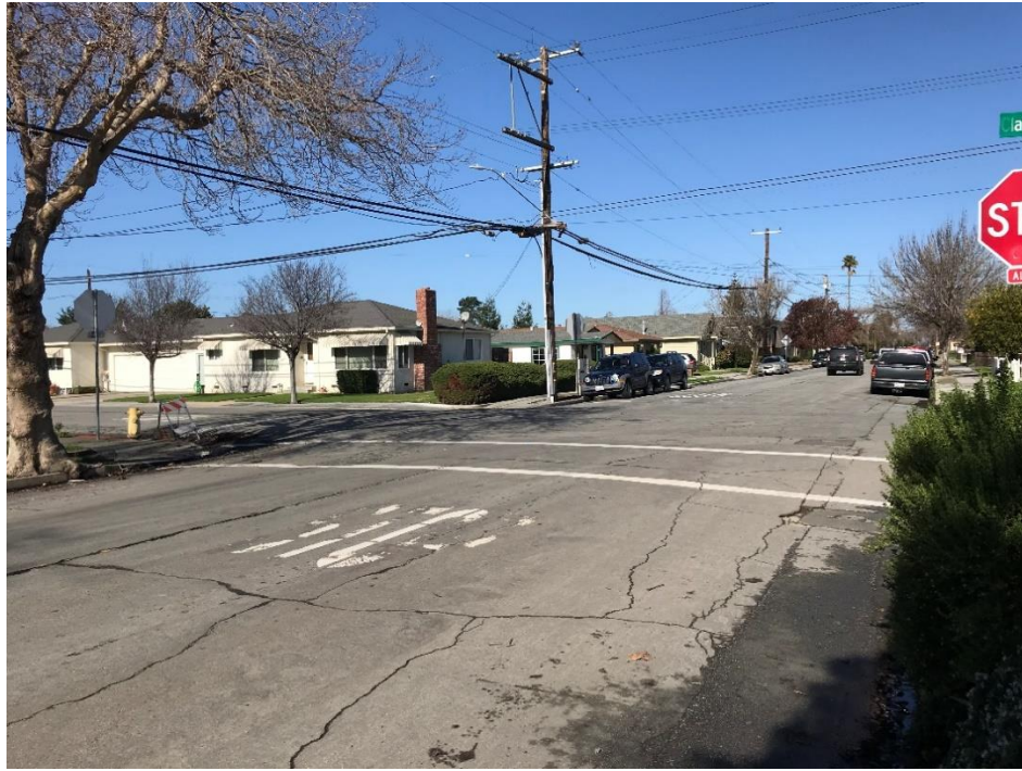
Riker St at Clay St Stop Approach