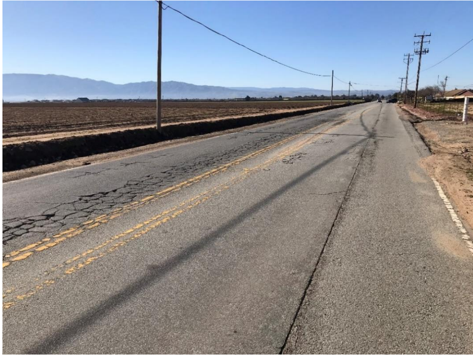
Williams Rd between E Boronda Rd and Old Stage Rd