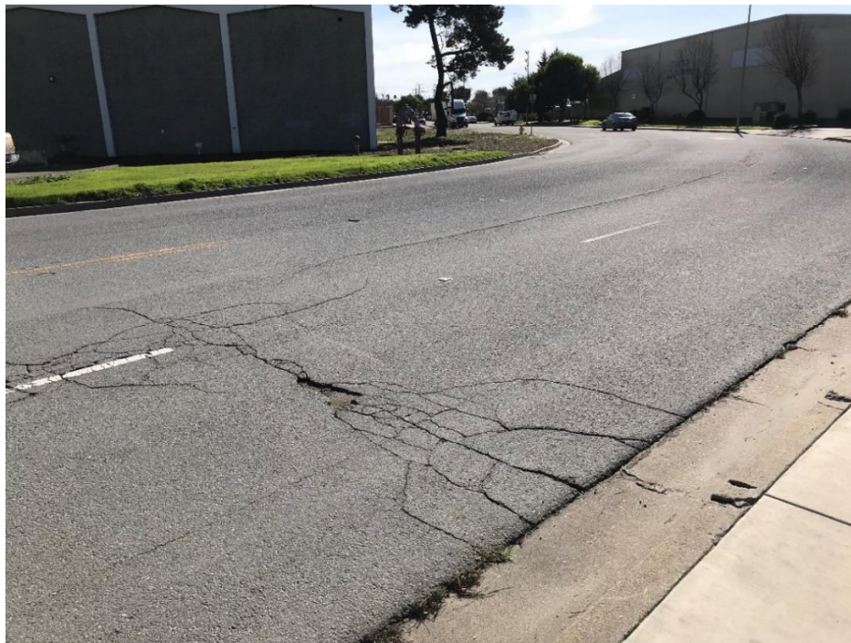
Schilling Pl E/O Harkins Rd