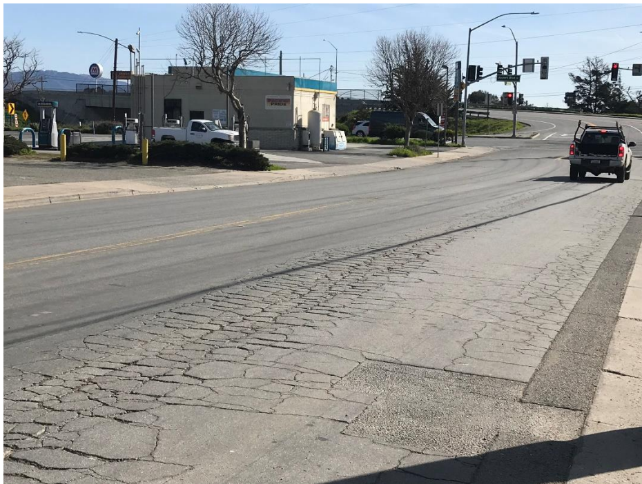
Terven Ave W/O Airport Blvd