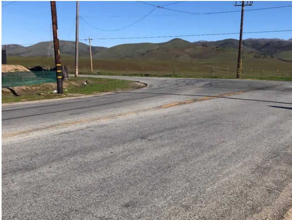
Williams Rd at Old Stage Rd

Williams Road between Old Stage Road and E Boronda Road