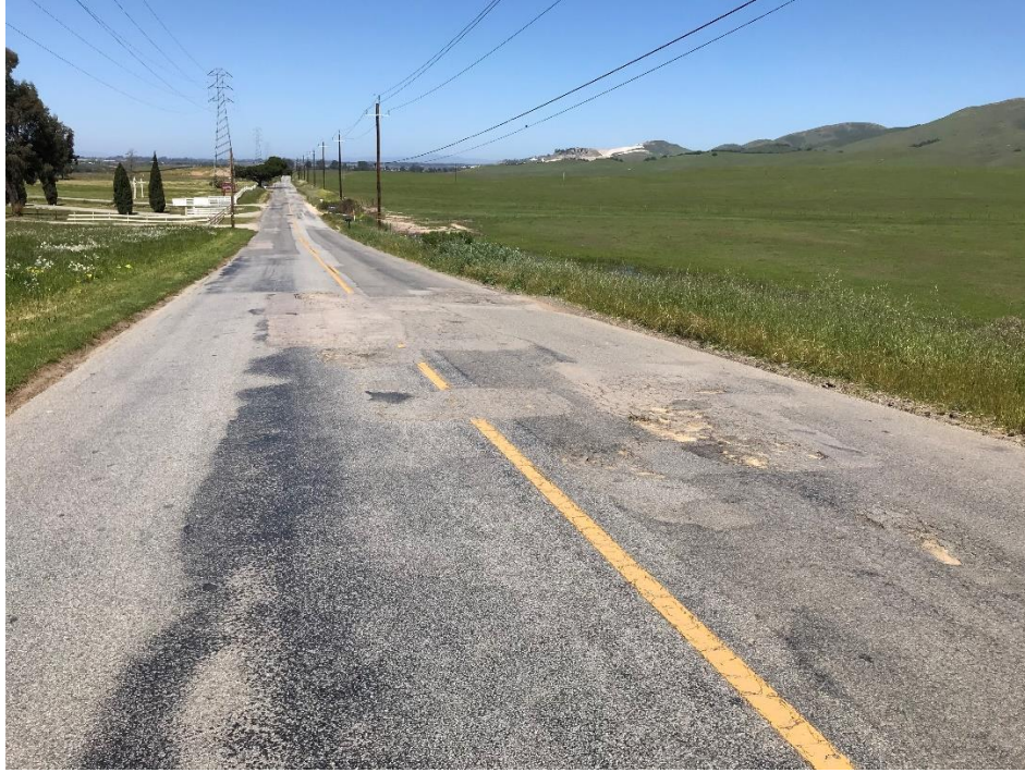
Old Stage Road N/O Williams Rd