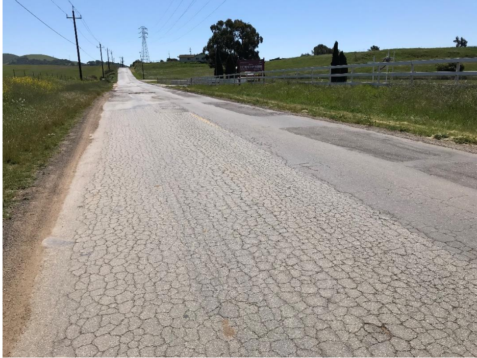
Old Stage Rd 900 Block

East Alisal Street between Griffin Street and Work Street