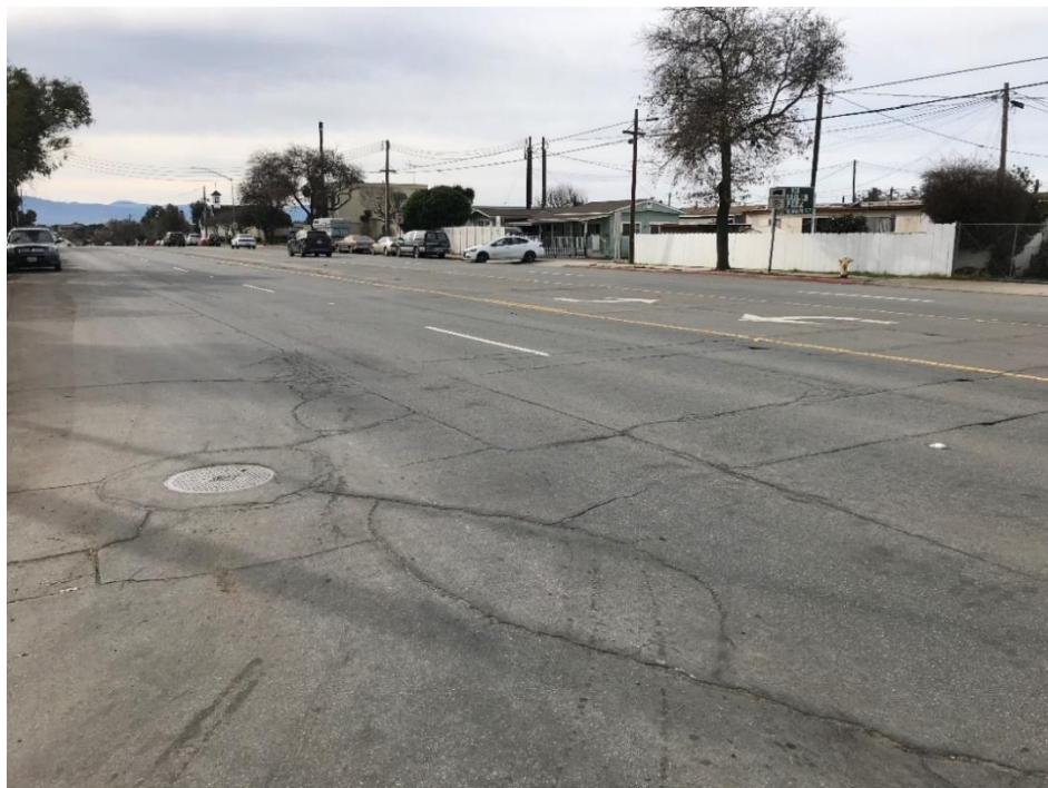
N Main St N/O Bolivar St