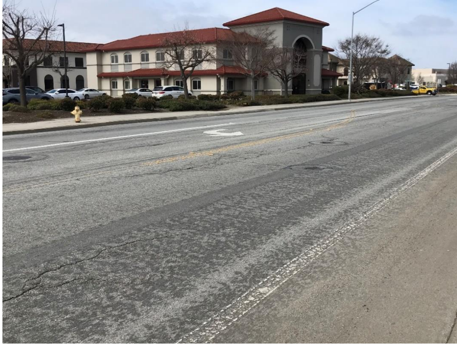
W Rossi St E/O Quail Run Cir

Harkins Road between Hansen Street and Southernly City Limits