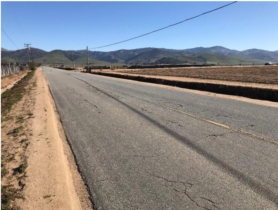
Williams Rd between E Boronda Rd and Old Stage Rd