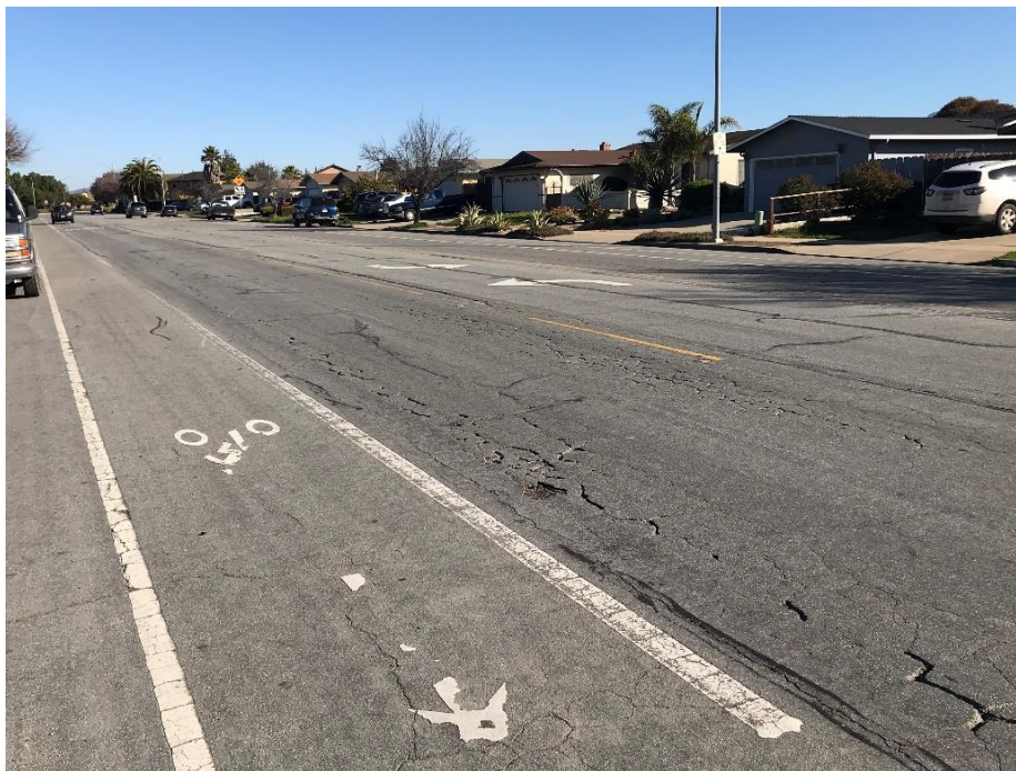
El Dorado Dr at Calaveras Dr

El Dorado Drive between Harden Parkway and Mendocino Drive