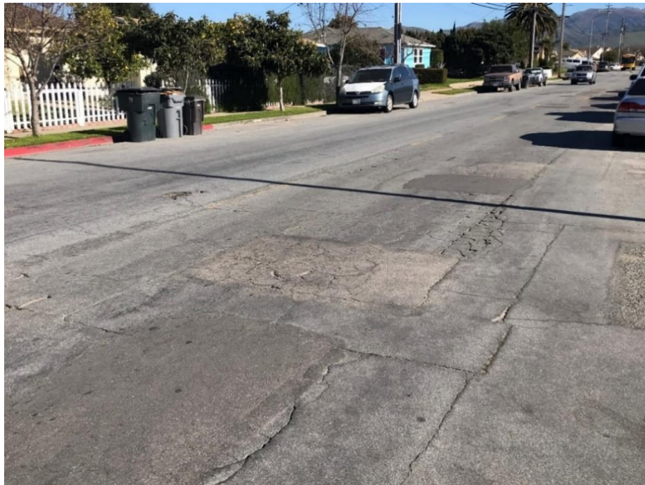
Rider Ave between Del Monte Ave and Mimbrera Wy