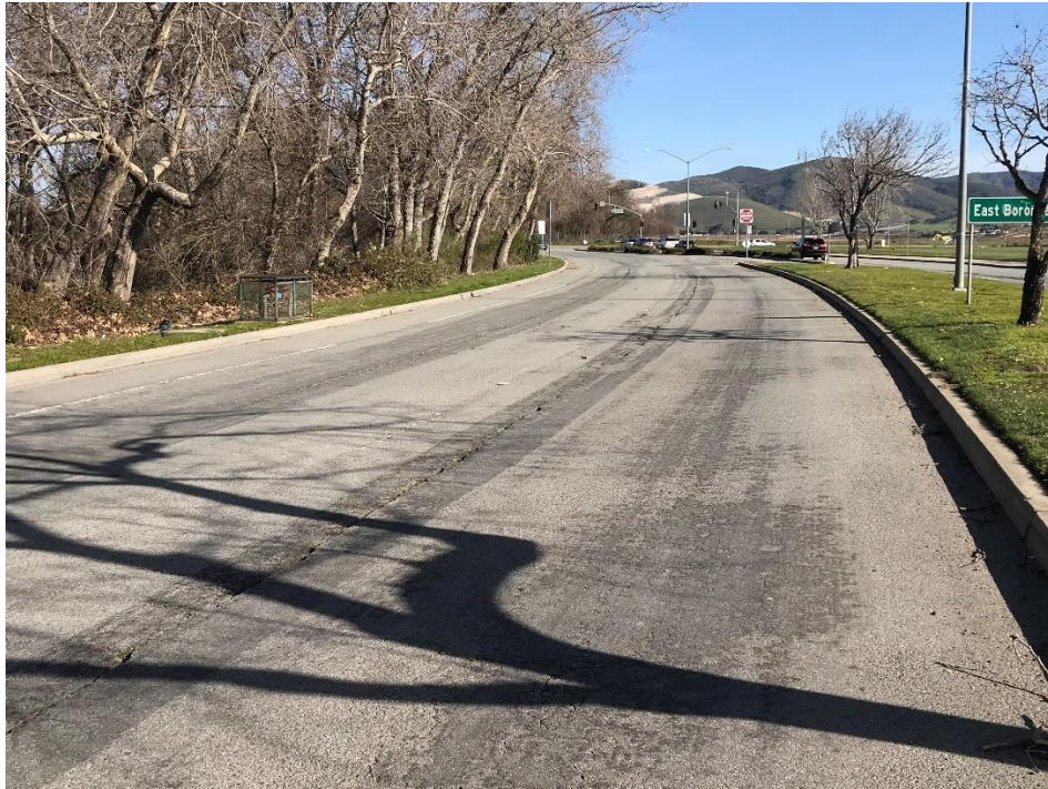
Independence Blvd between E Boronda Rd and Danbury St

Independence Boulevard between East Boronda Road and Nantucket Boulevard