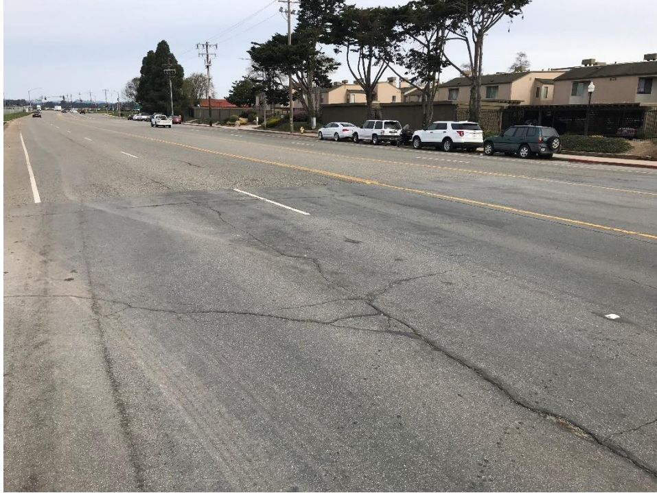
N Main St S/O Russell Rd

Williams Road between Old Stage Road and E Boronda Road