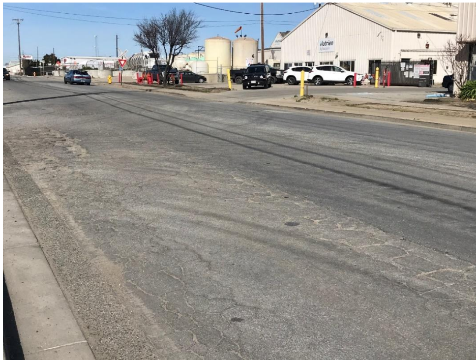
Terven Ave W/O Vertin Ave