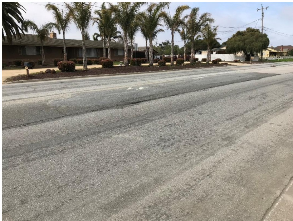
W Rossi St E/O Powell St