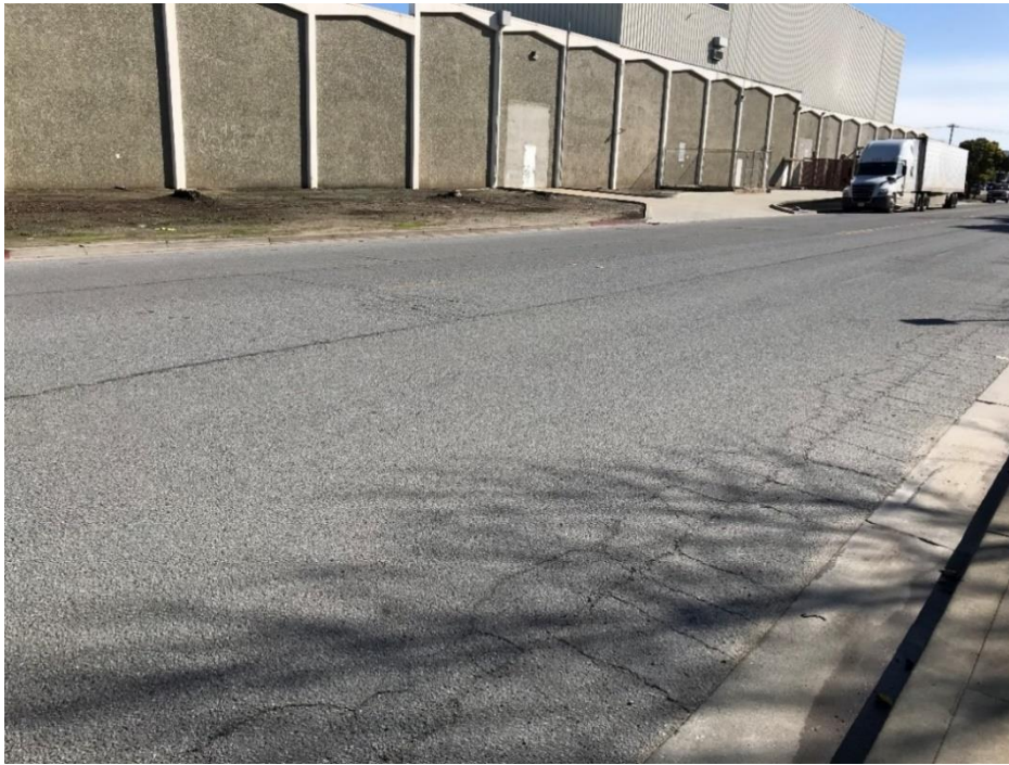
Schilling Pl between Harkins Rd and Eden St