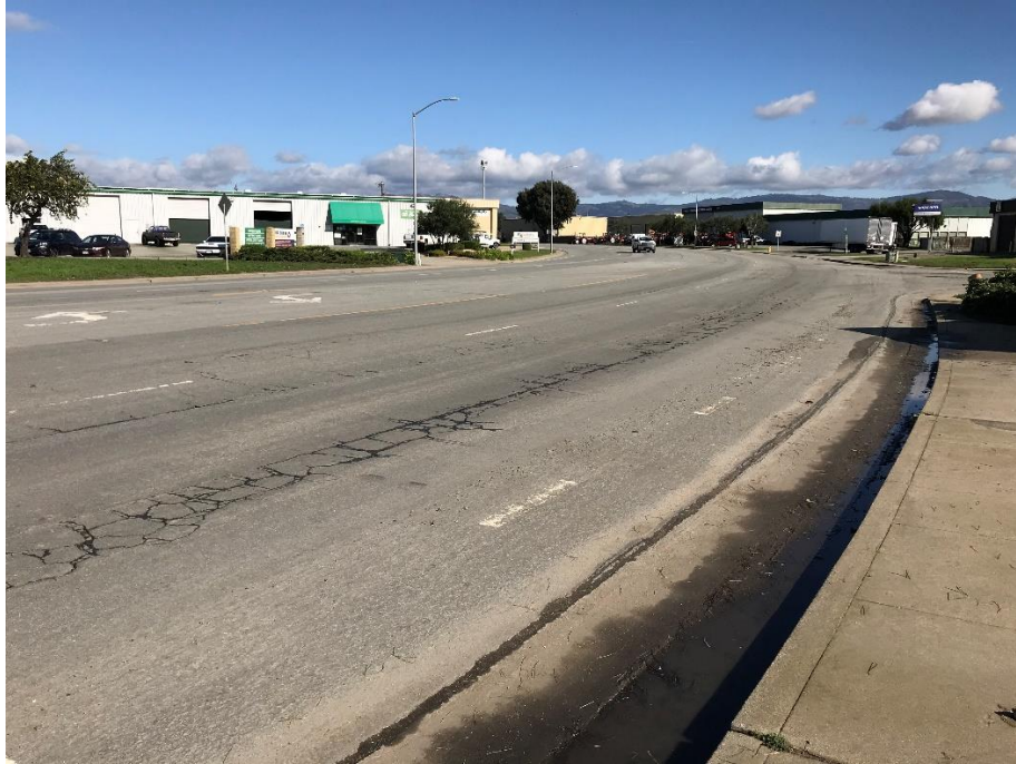
Harkins Rd at Burton St

El Dorado Drive between Harden Parkway and Mendocino Drive