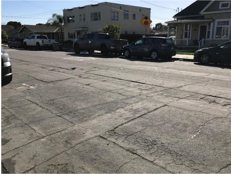
Maple St E/O S Main St