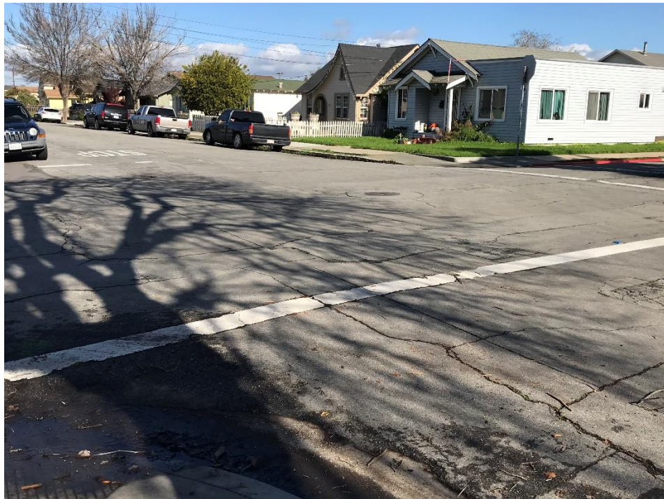
Riker St at Clay St Northbound