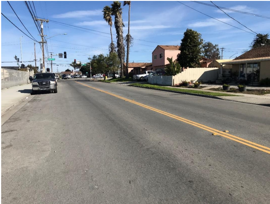
Towt St S/O E Market St