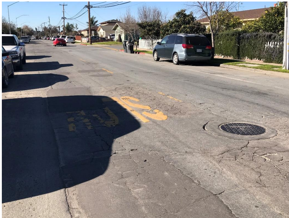
Rider Ave E/O Amarillo Wy