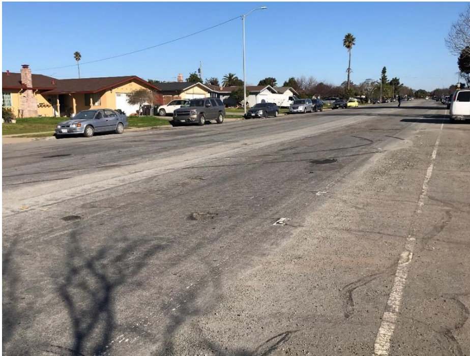
El Dorado Dr at Mendocino Dr