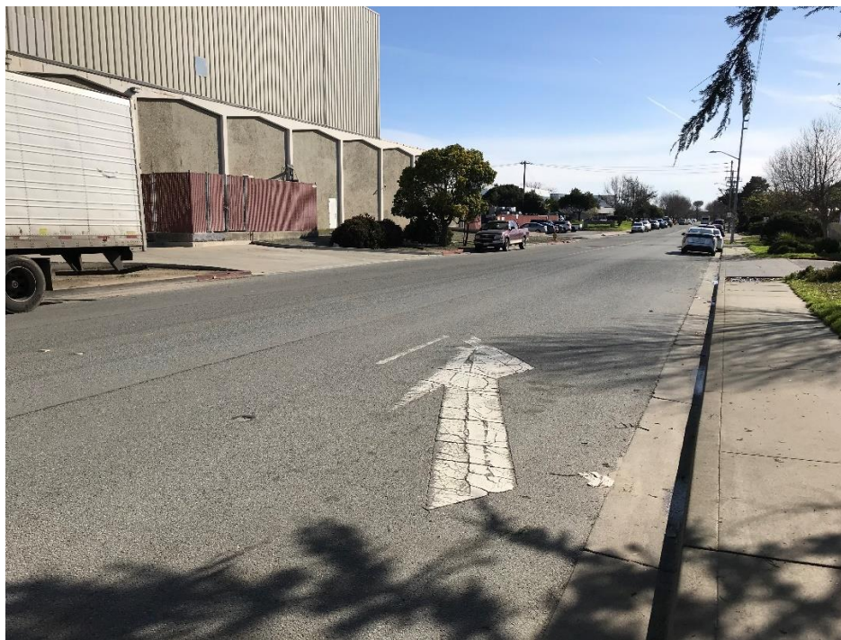
Schilling Pl W/O Eden St