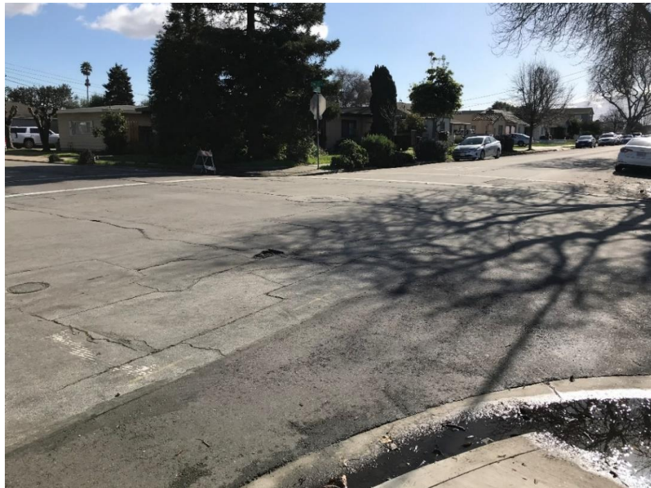
Riker St at Clay St