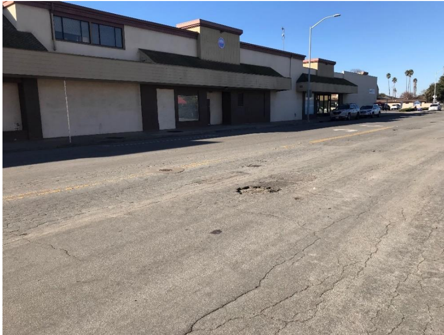
W Romie Ln at S Main St