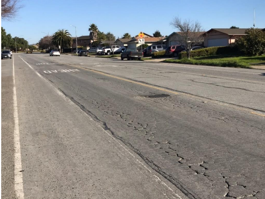
El Dorado Dr N/O Calaveras Dr

North Main Street between Boronda Road and Russell Road