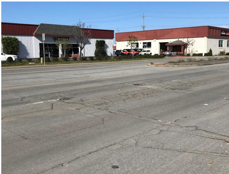
Harkins Rd S/O Abbott St