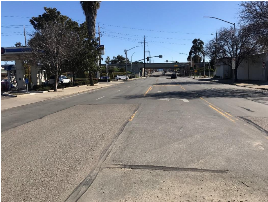
E Alisal St E/O Work St