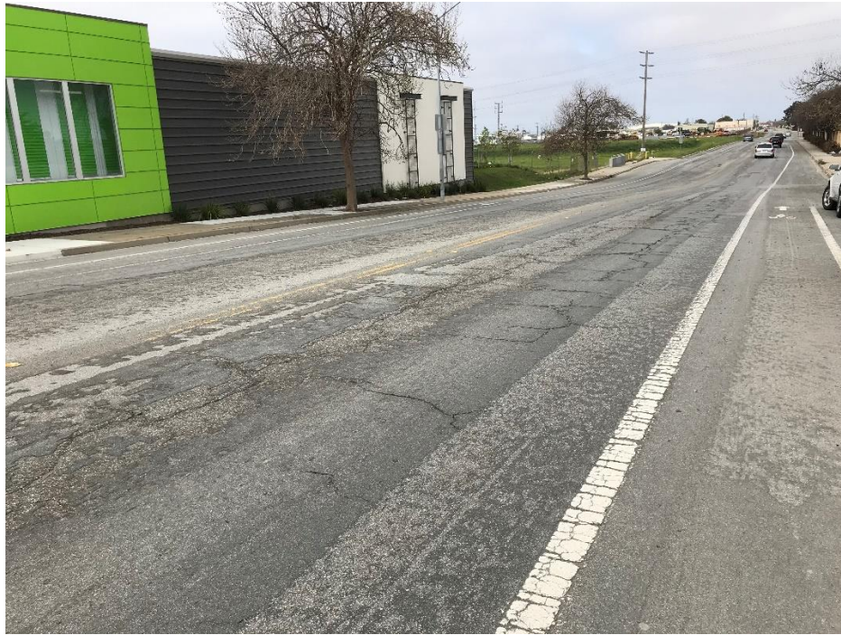
W Rossi St W/O S Main St