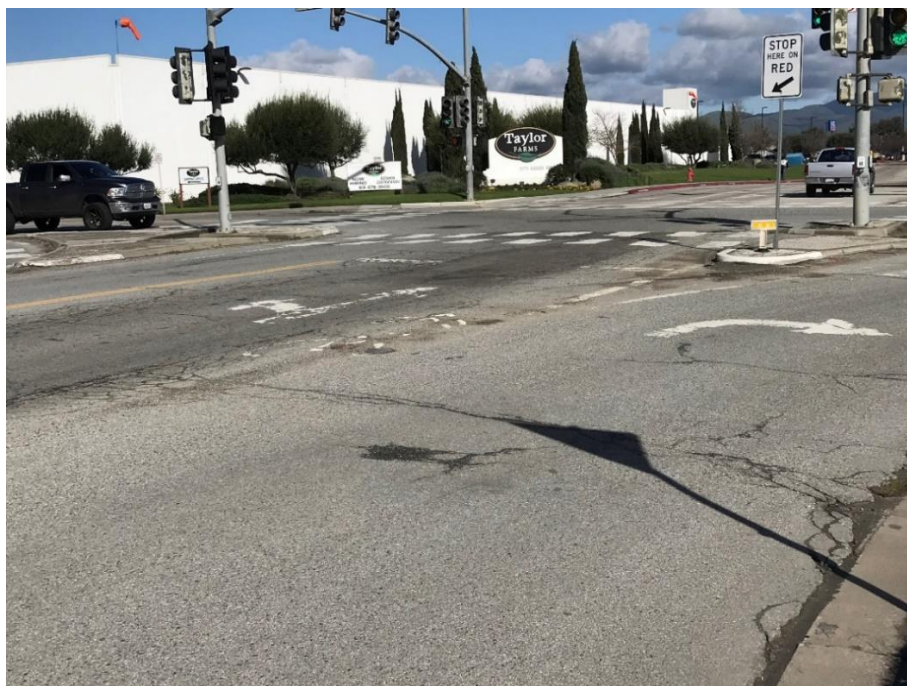
Harkins Rd at Hansen St

Harkins Road between Hansen Street and Southernly City Limits