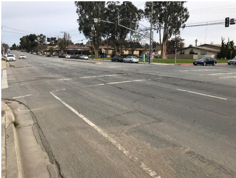
N Main St at Bolivar Dr

North Main Street between Boronda Road and Russell Road