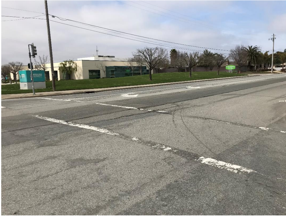
W Rossi St at Rico St