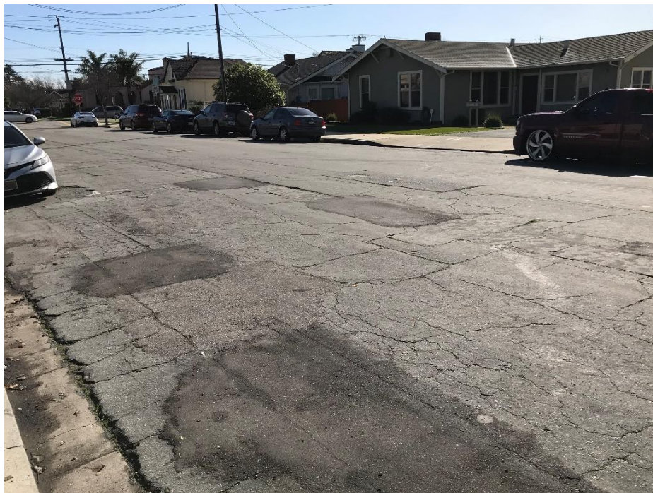
Maple St W/O Pajaro St