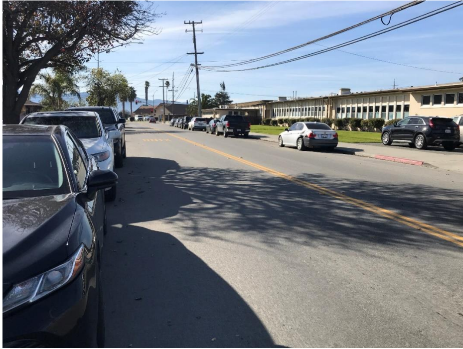
Towt St N/O E Alisal St