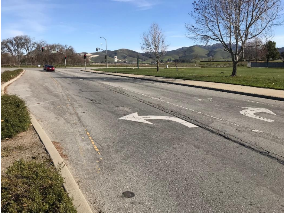
Independence Blvd S/O E Boronda Rd