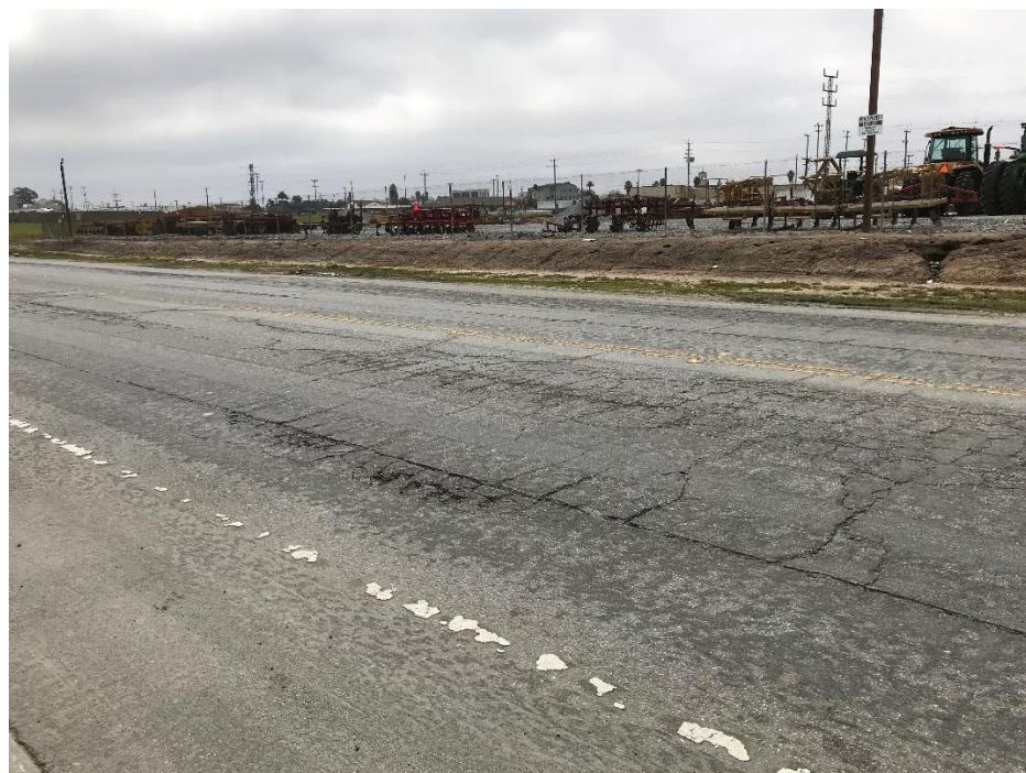
W Rossi St E/O Martella St