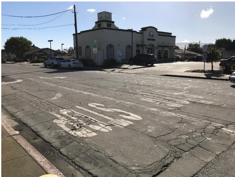
Maple St at S Main St