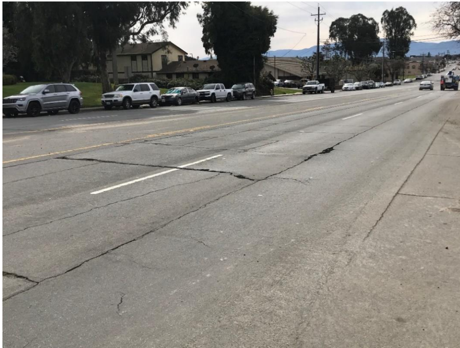
N Main St between Boronda Rd and Bolivar Dr