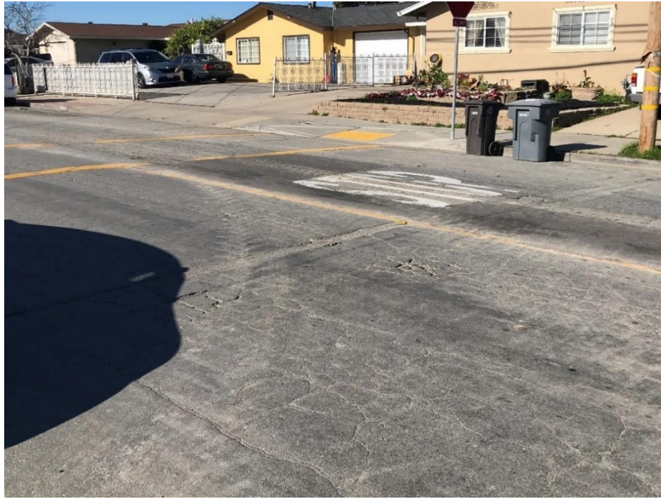
Rider Ave at Del Monte Ave