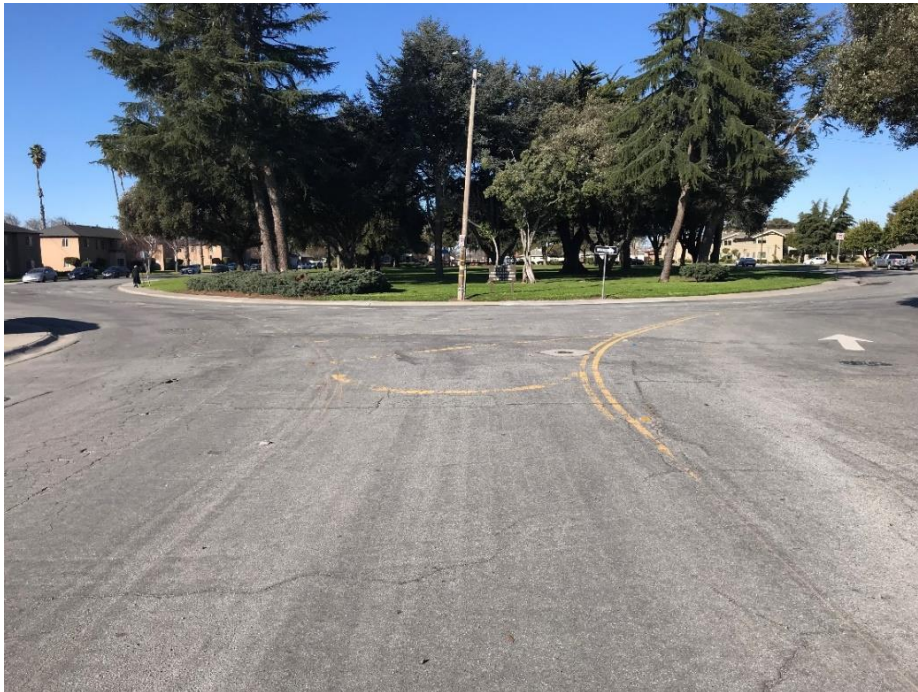
W Romie Ln at Padre Dr