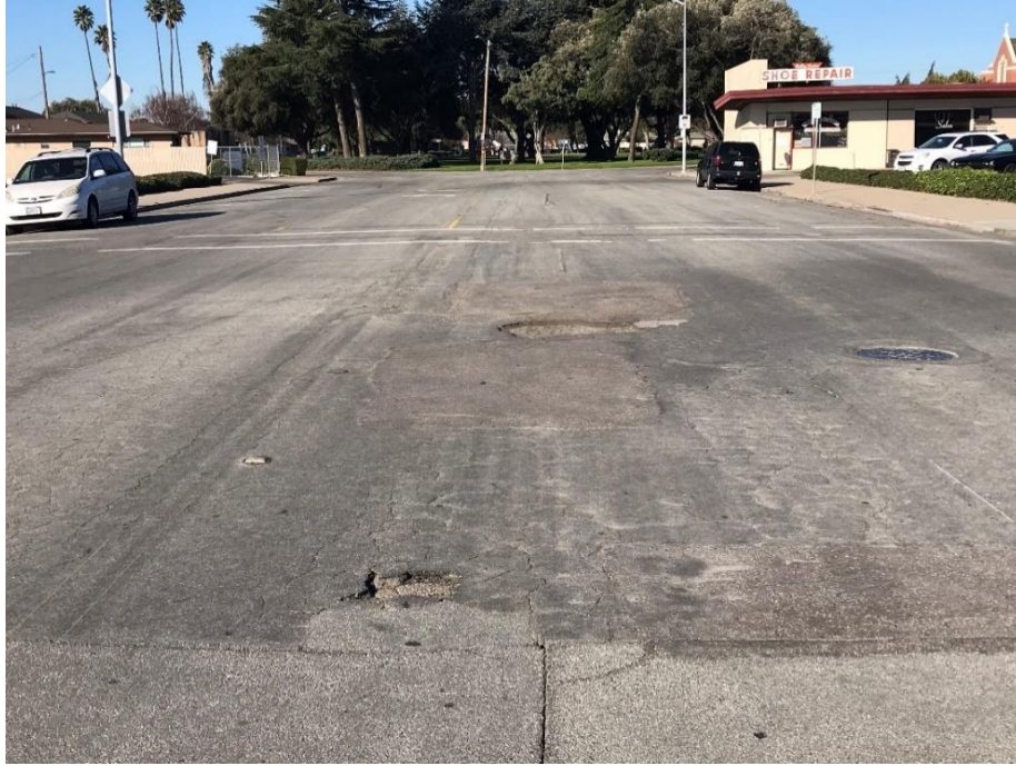
W Romie Ln between S Main St and Padre Dr