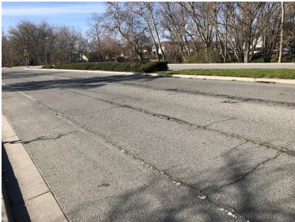
Independence Blvd N/O Danbury St