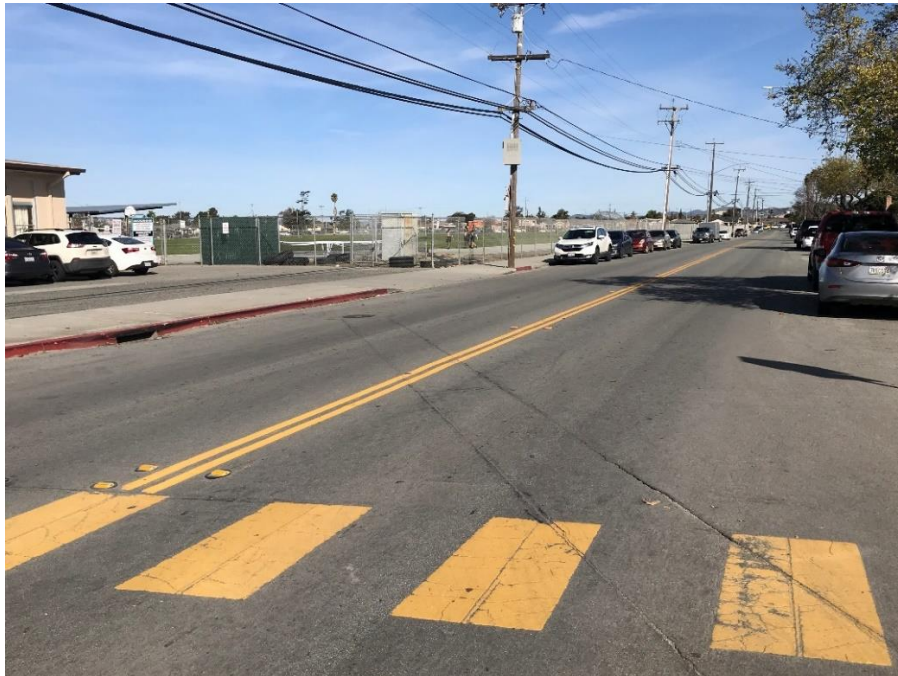
Towt St N/O E Alisal St