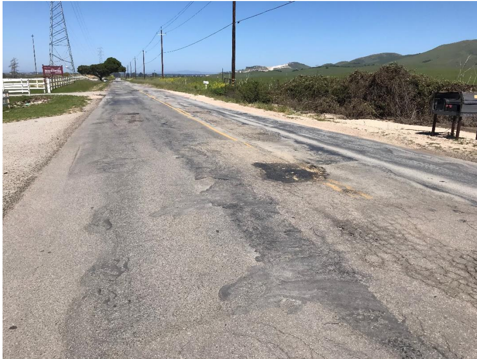
Old Stage Rd 900 Block