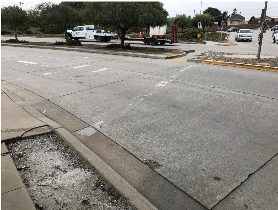
E Market St at Front St