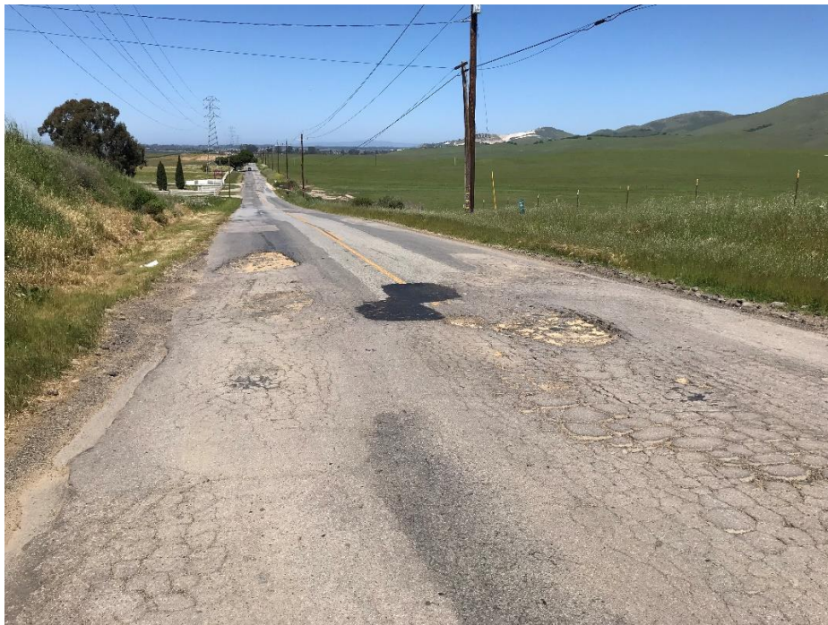
Old Stage Rd N/O Williams Rd

Old Stage Road between Williams Road and 900 Block