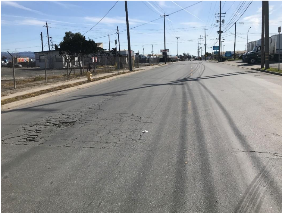
Terven Ave E/O Sanborn Pl