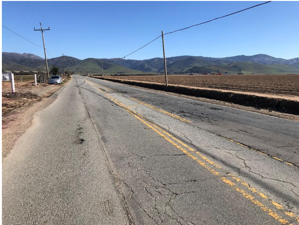
Williams Rd between E/O E Boronda Rd

Old Stage Road between Williams Road and 900 Block