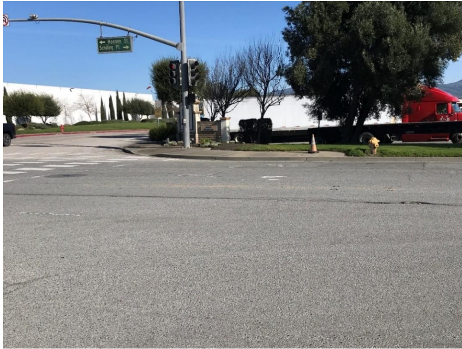
Schilling St at Harkins Rd