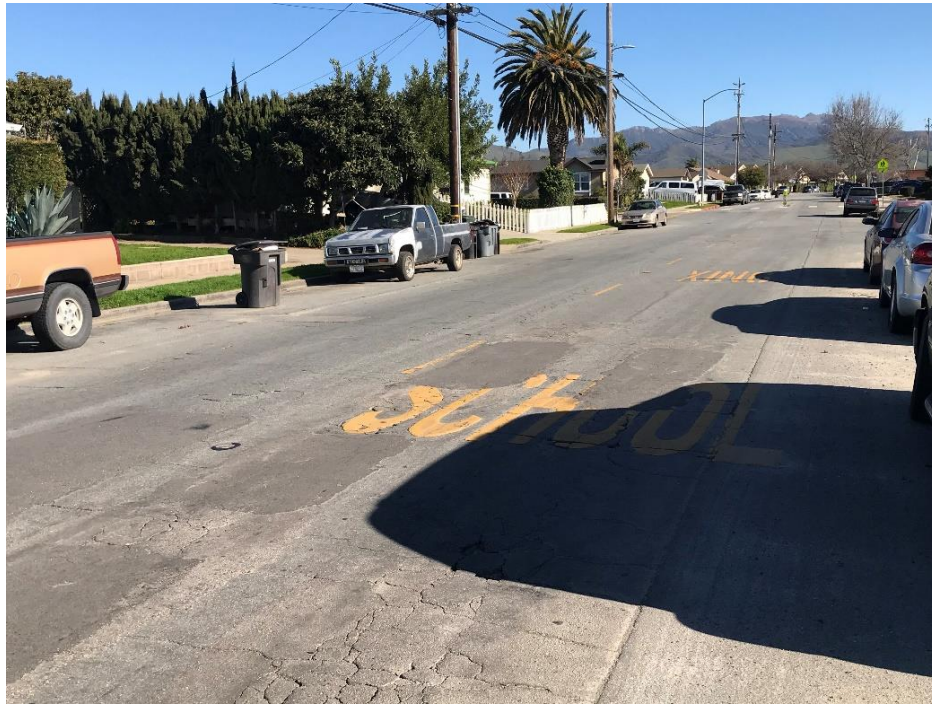
Rider Ave W/O Mimbrera Way