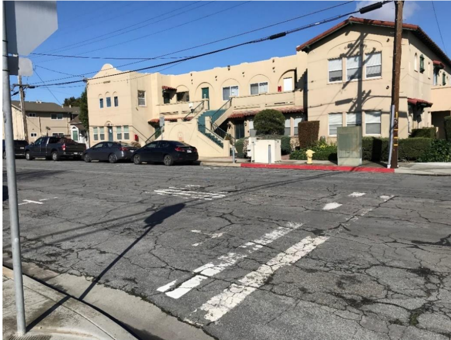
Maple St at Pajaro St