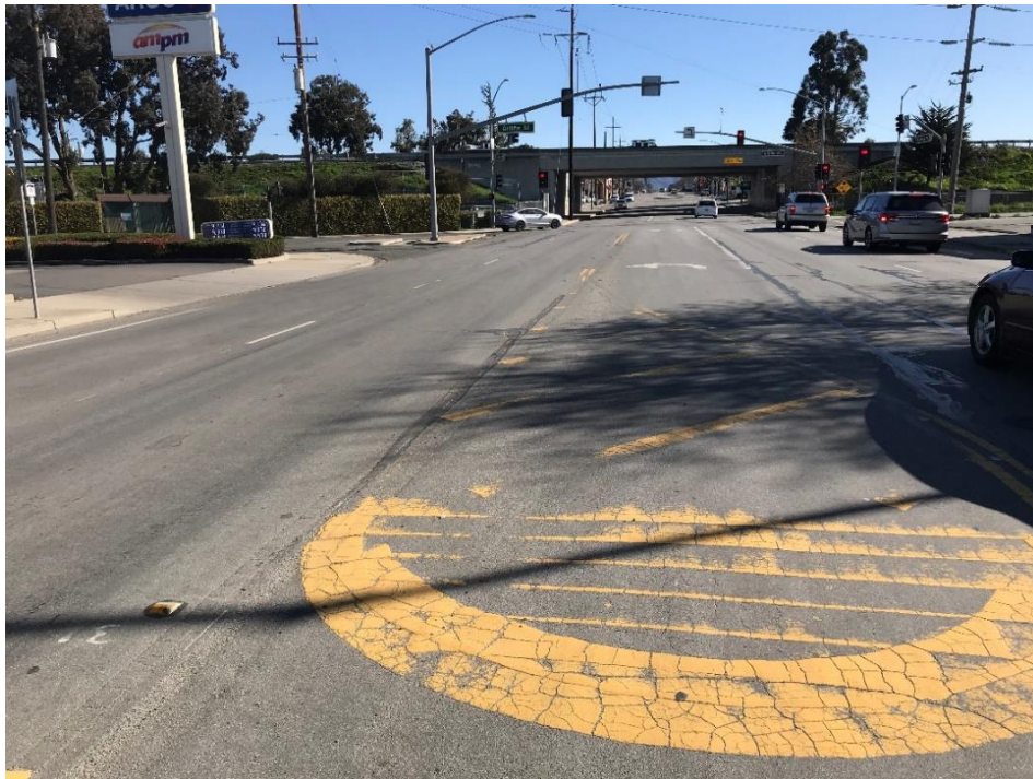
E Alisal St between Work St and Griffin St