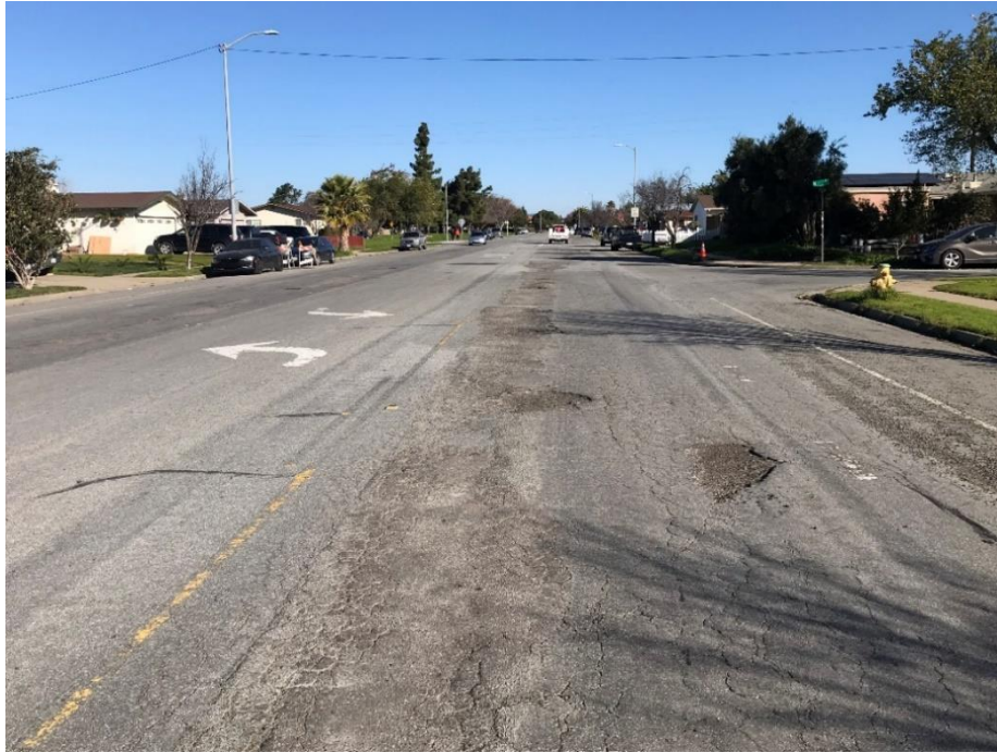
El Dorado Dr between Napa Wy and Mendocino Dr