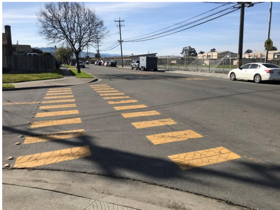
Towt St at Second Ave