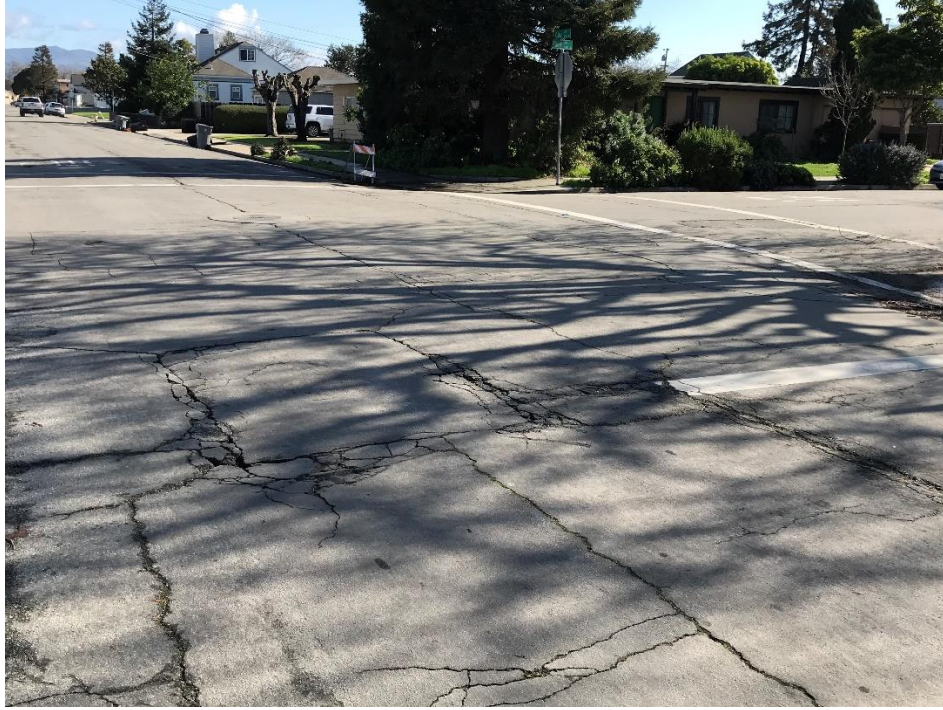
Riker St at Clay St Eastbound