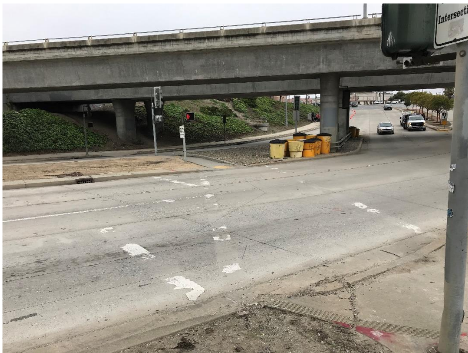
E Market St Northbound

East Market St/Front St between Front Street and Sherwood Dr