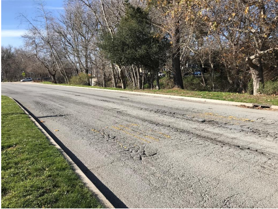
Independence Blvd S/O Danbury St

East Market St/Front St between Front Street and Sherwood Dr