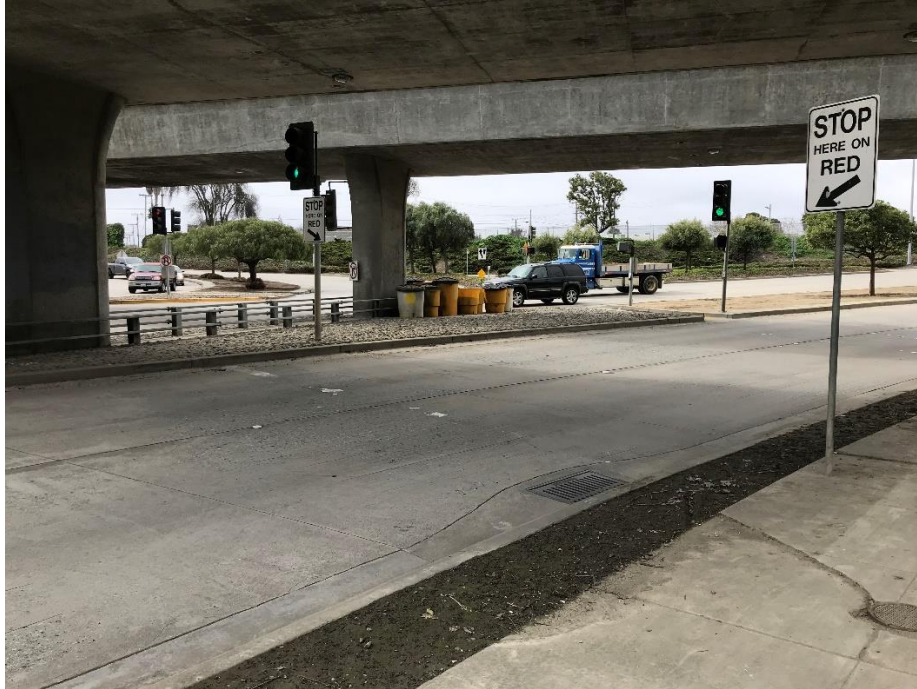
E Market St Southbound