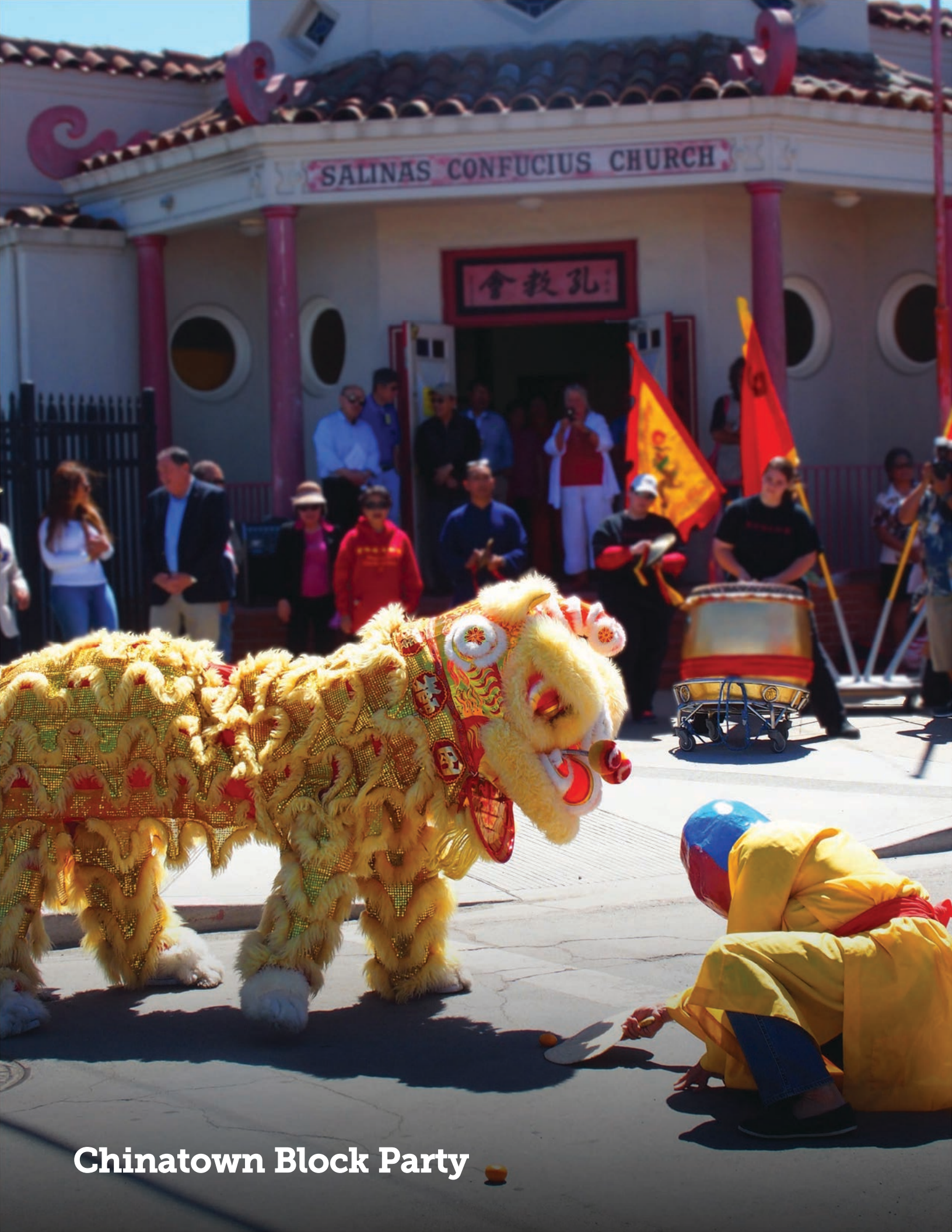
Chinatown Block Party