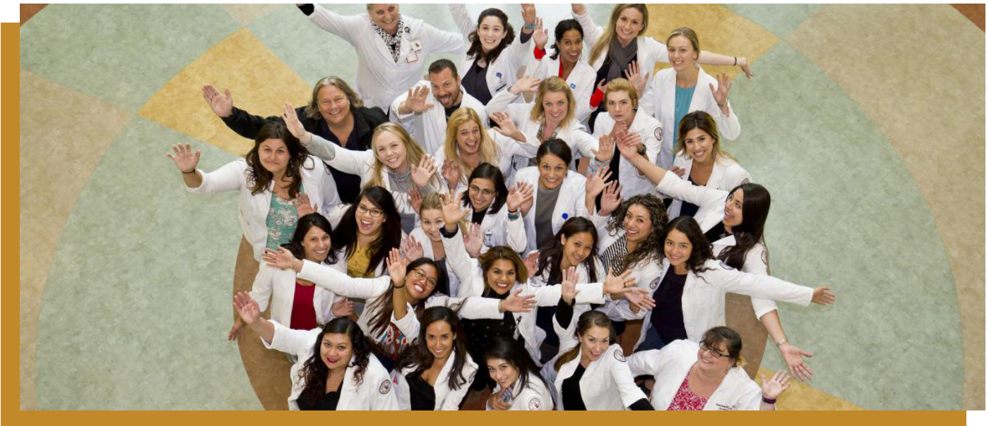
Nursing students' graduation at Hartnell College in Salinas