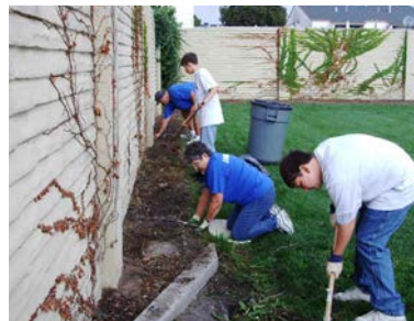
Neighborhood Vibrancy/Urban Greening Plan 2017