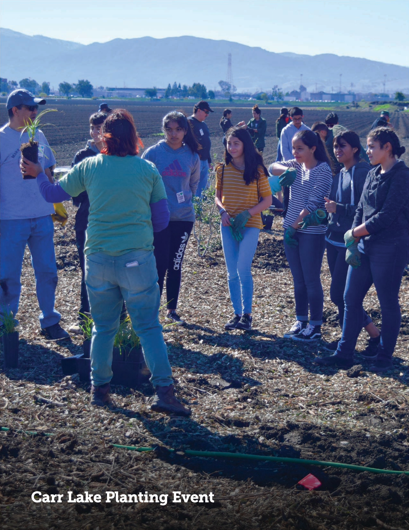
Carr Lake Planting Event