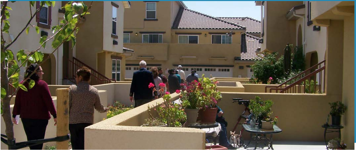
Affordable multi-family units at El Tesor in northern Salinas