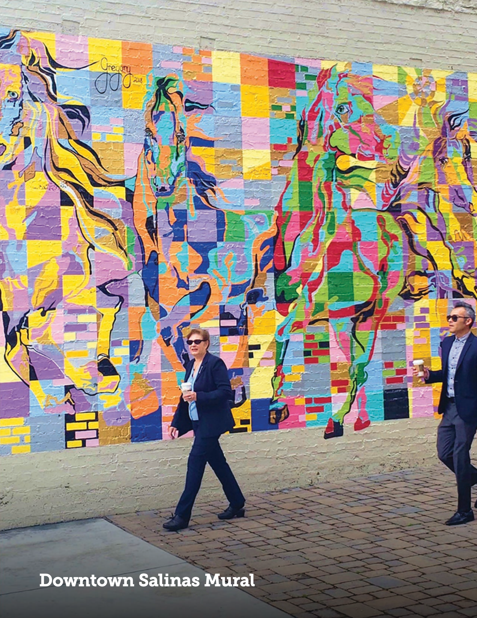
Downtown Salinas Mural