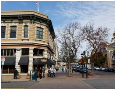
Downtown Vibrancy Plan 2015