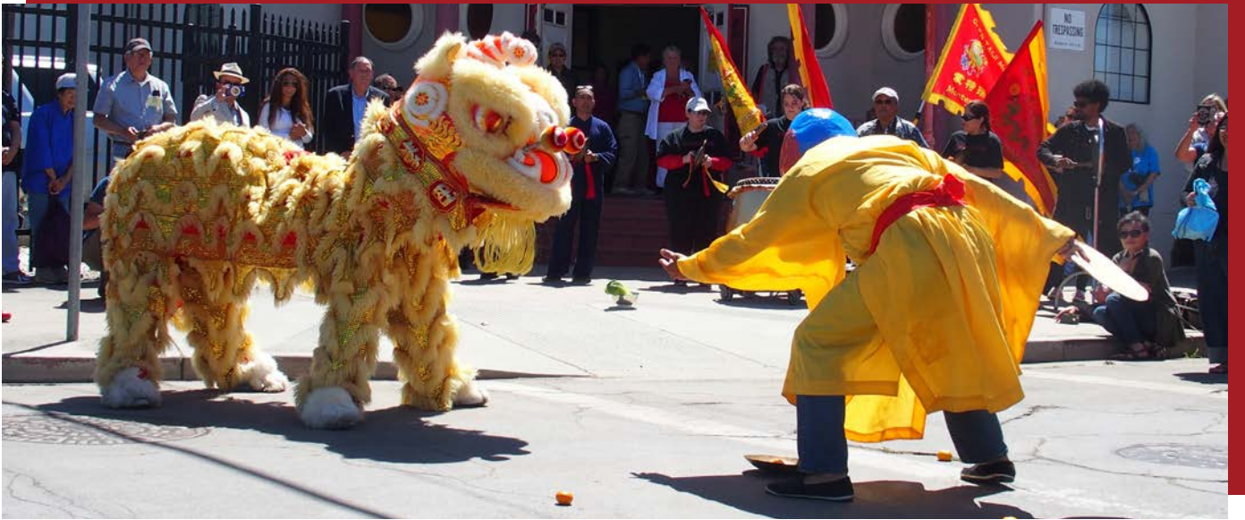
The Lion Dance at the 2017 Salinas Asian Festival in Chinatown