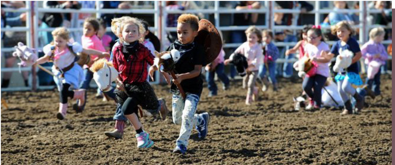
"Horsies" race at the California Rodeo, Salinas