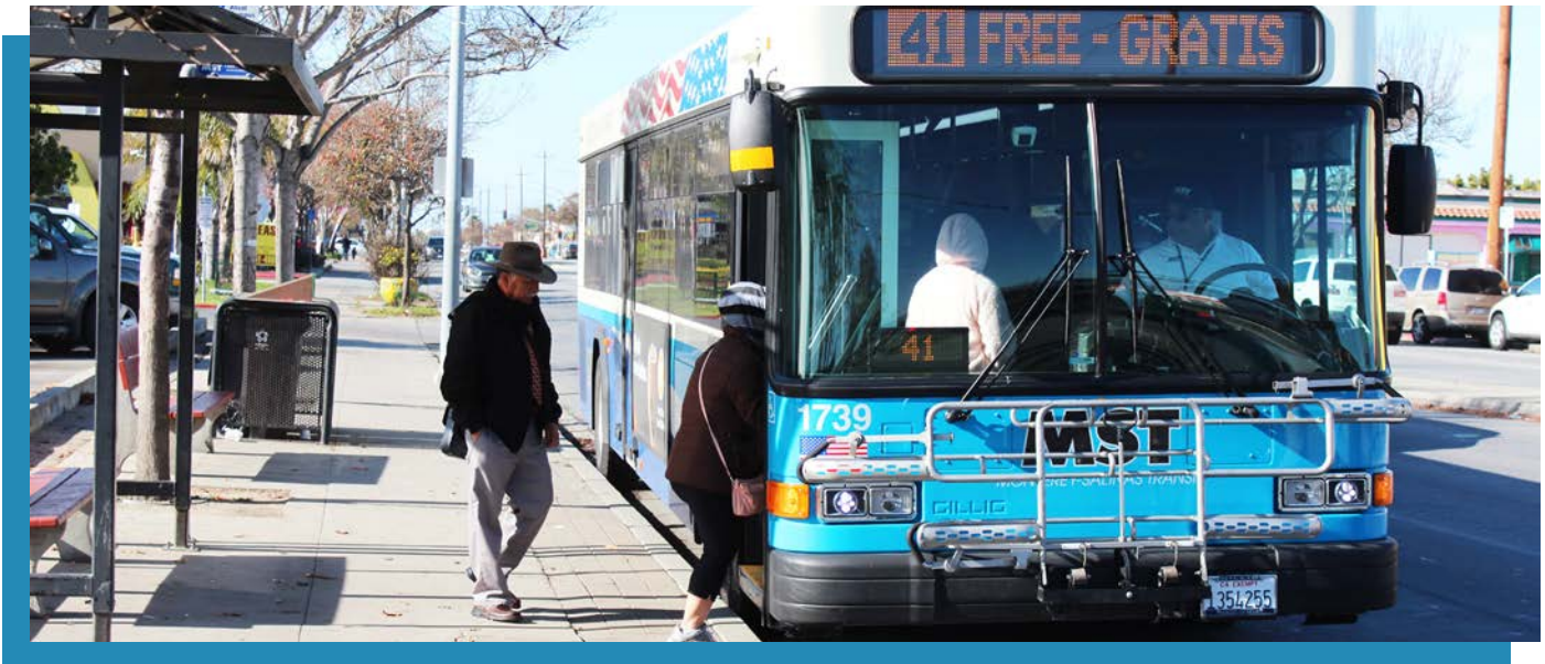
A free Monterey-Salinas Transit (MST) bus ride on New Years Day, 2019