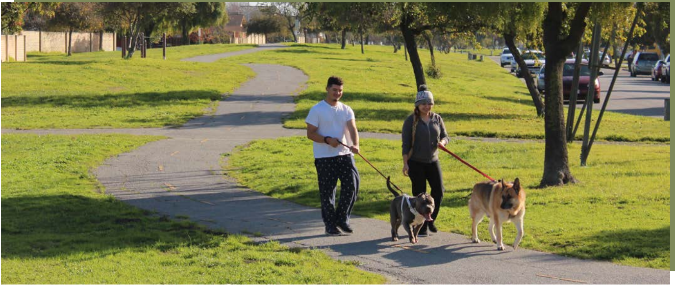
Dogwalking at the Rossi-Rico Greenway in west Salinas