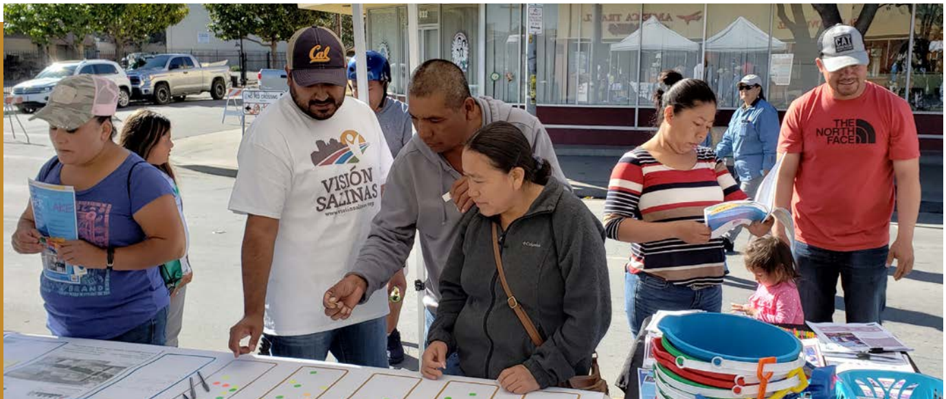
Alisal Vibrancy Plan Popup event at Ciclovía, 2018