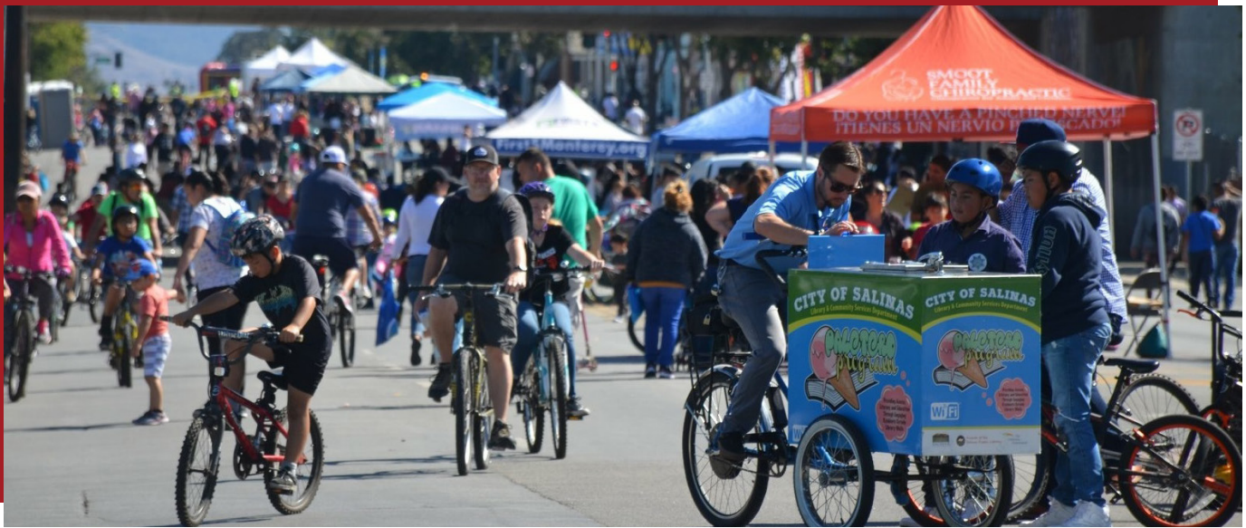
Ciclovía—an entirely youth-led event on Alisal Street in east Salinas