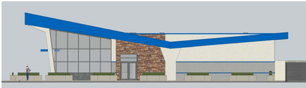
P1 - ALTERNATE EAST ELEVATION DESIGN CONCEPT