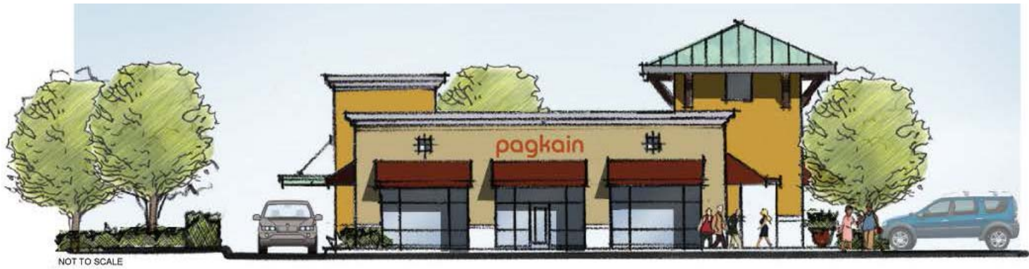
P1 - SOUTH ELEVATION DESIGN CONCEPT