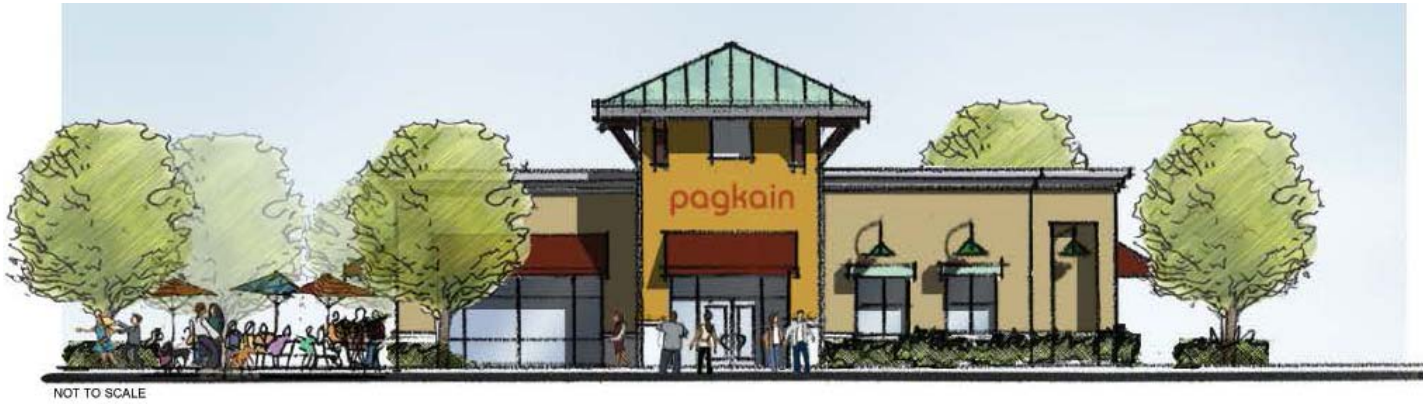
P1 - EAST ELEVATION DESIGN CONCEPT