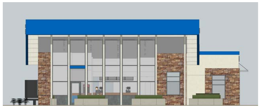
P1 - ALTERNATE SOUTH ELEVATION DESIGN CONCEPT