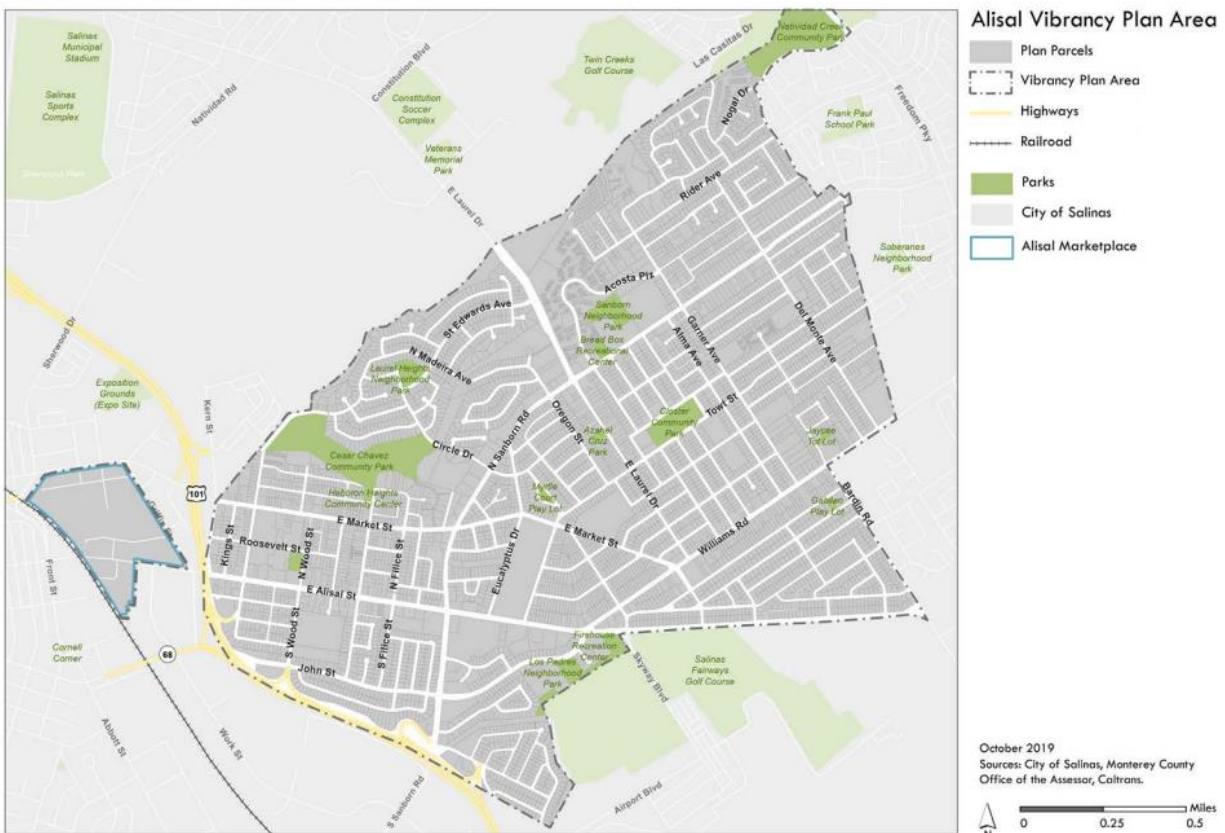
Figure 1.1 Alisal Vibrancy Plan Area

The Alisal Vibrancy Plan is action driven and contains efforts that could span 10 to 15 years. Each chapter identifies community defined priorities and includes short, mid, and long-term actions. Chapter 10 contains an implementation matrix that highlights immediate steps for the first one to two years and identifies potential funding sources and partnership models.