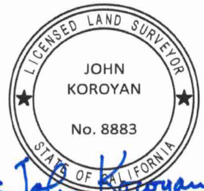
EXHIBIT "B" PLAT TO ACCOMPANY LEGAL DESCRIPTION

APN ASSESSOR'S PARCEL NUMBER PER ROLL YEAR 2023-2024 P.O.B. POINT OF BEGINNING — STREET VACATION