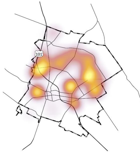
July 4 Citations