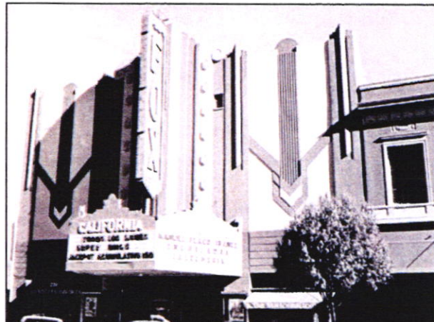
Figure 2. Circa-1988 image of the west elevation.