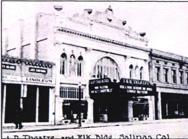
Figure 1. Circa-1921 image of the Beaux Arts design.