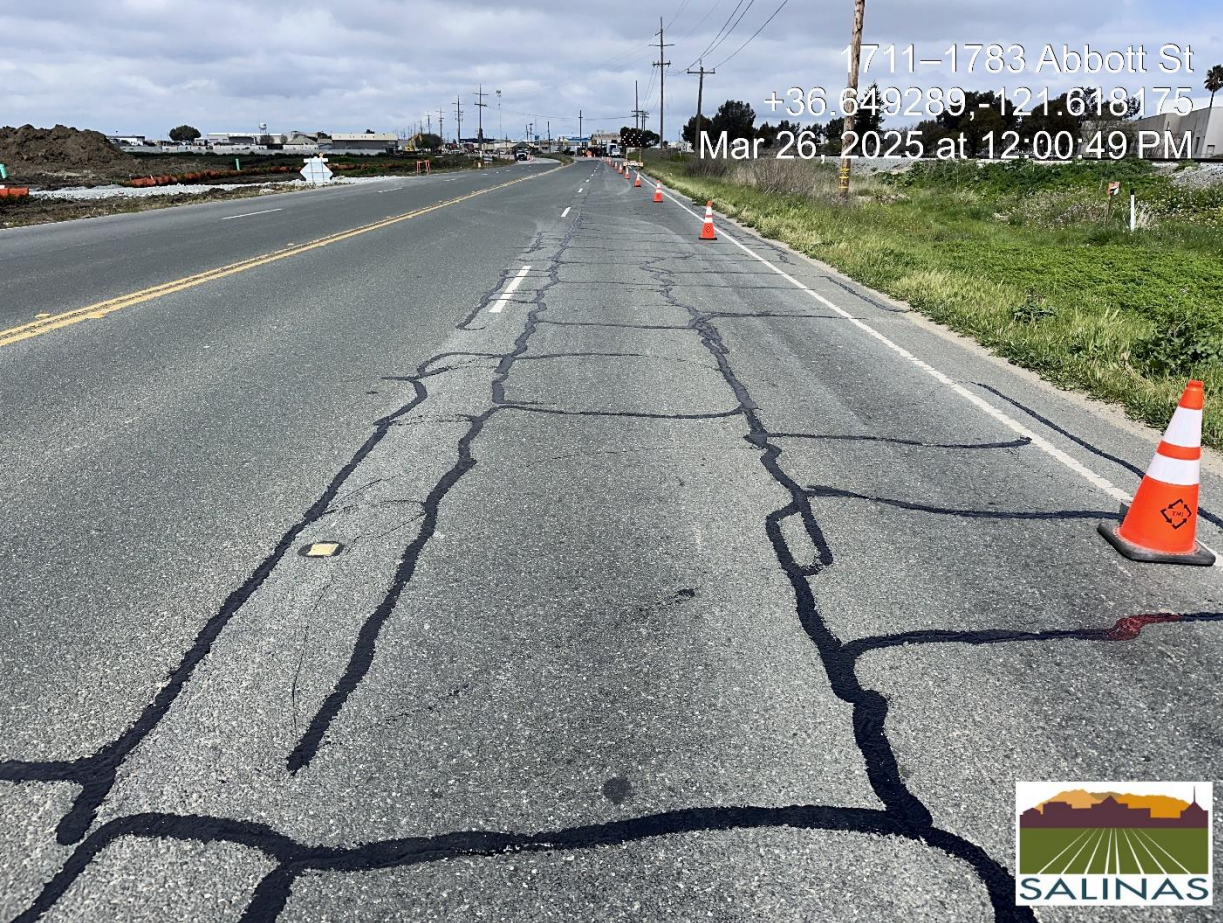
Crack Treatment Abbott St.