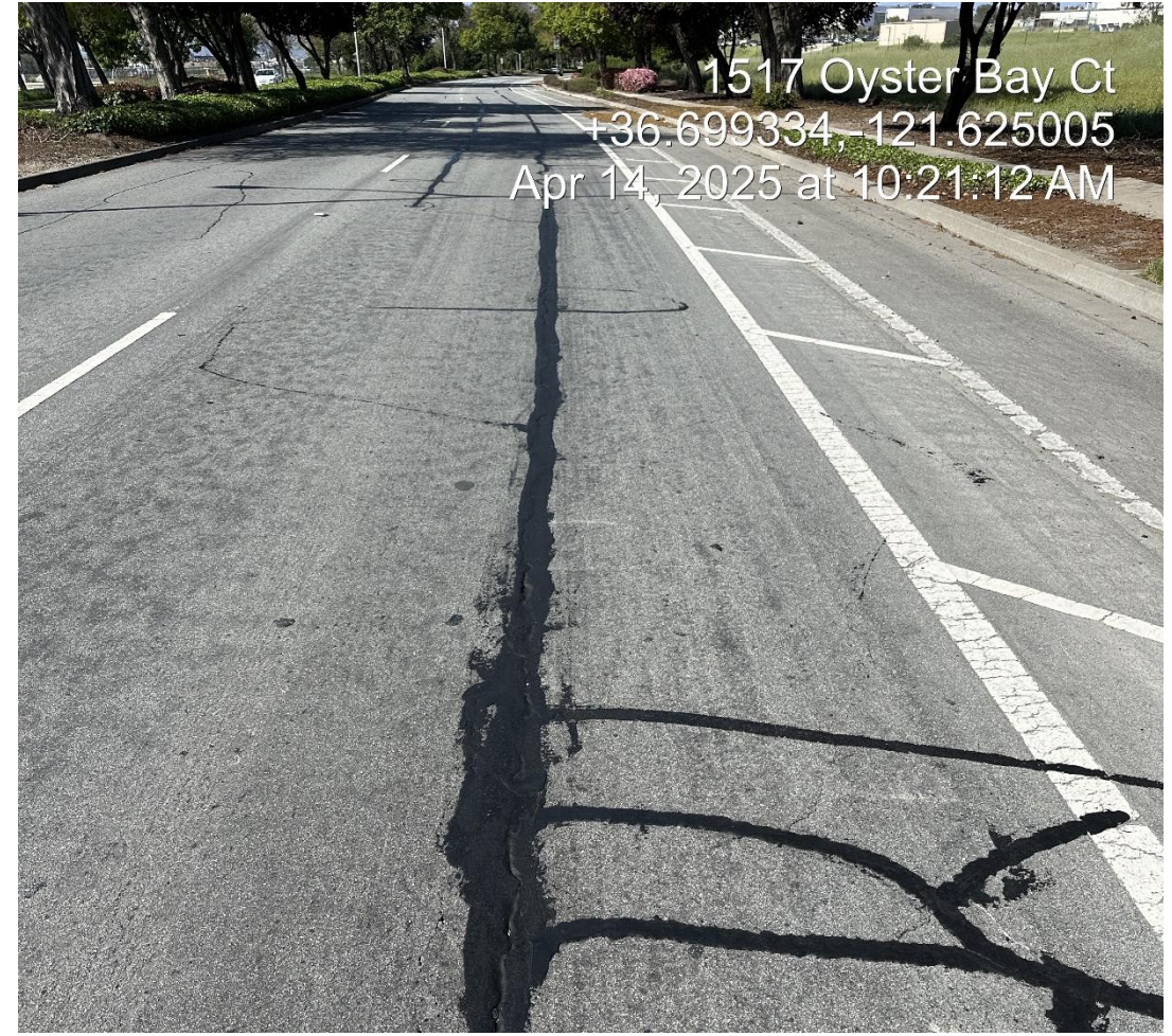
Crack Treatment – Constitution BLVD