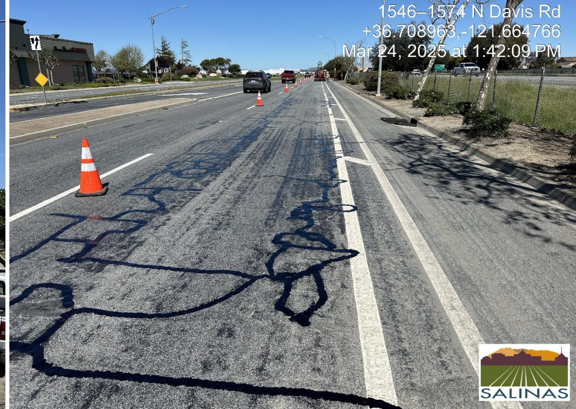
Crack Treatment N Davis Rd

1546-1574 N Davis Rd +36.708963,-121.664766 Mar 24, 2025 at 1:42:09 PM