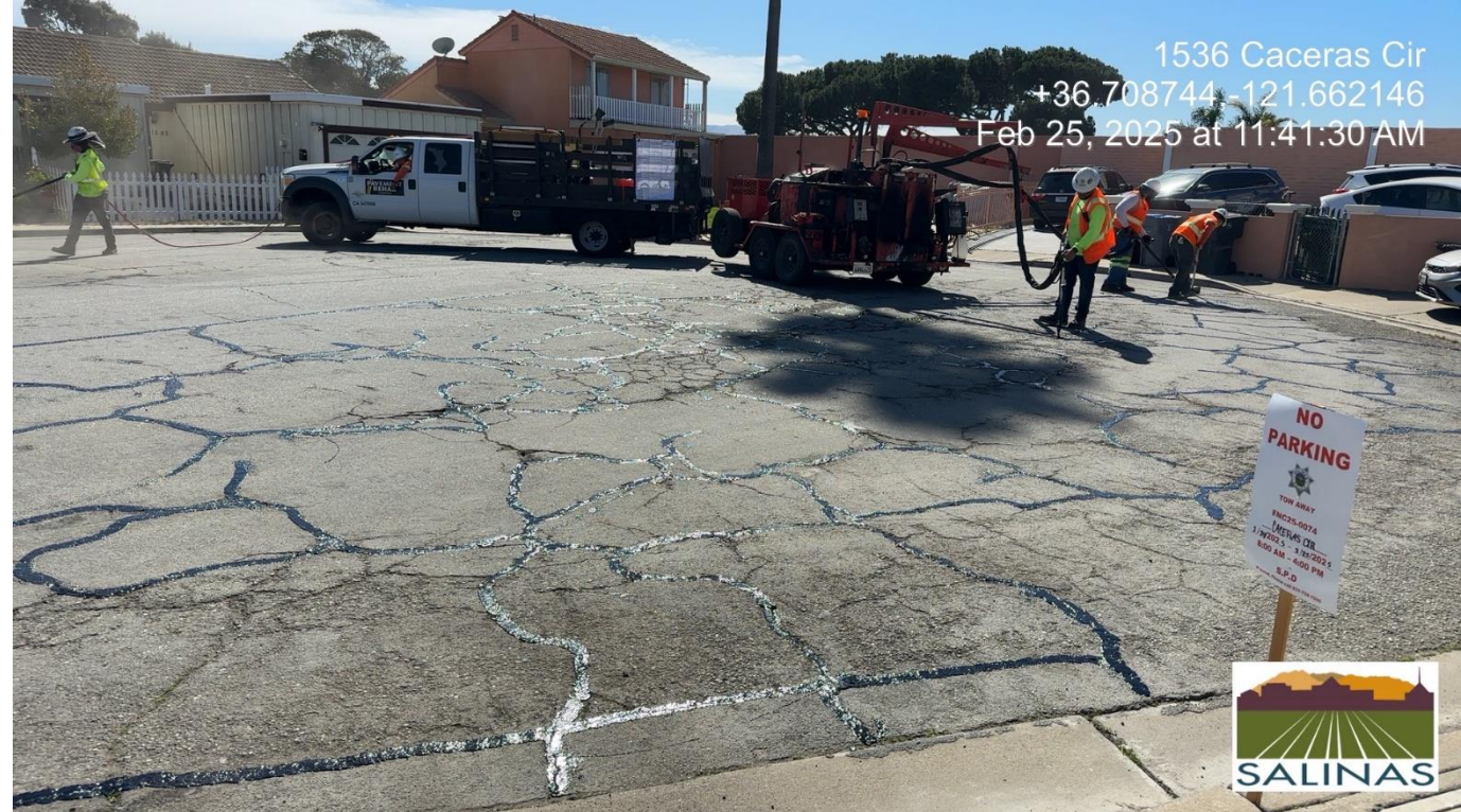
Crack Treatment Garner Ave & Caceras Cir.