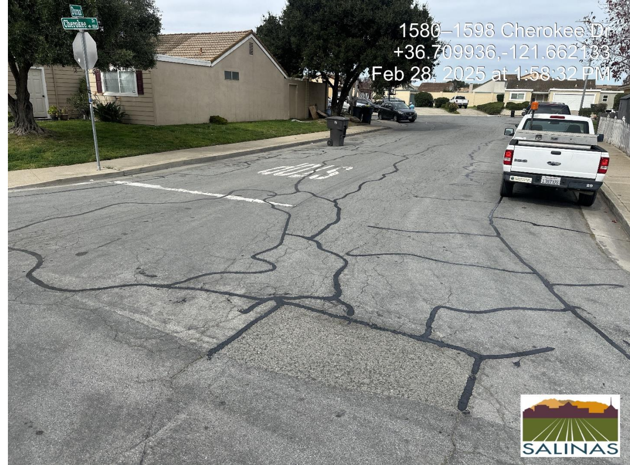
Crack Treatment Duran St & Cherokee Dr.