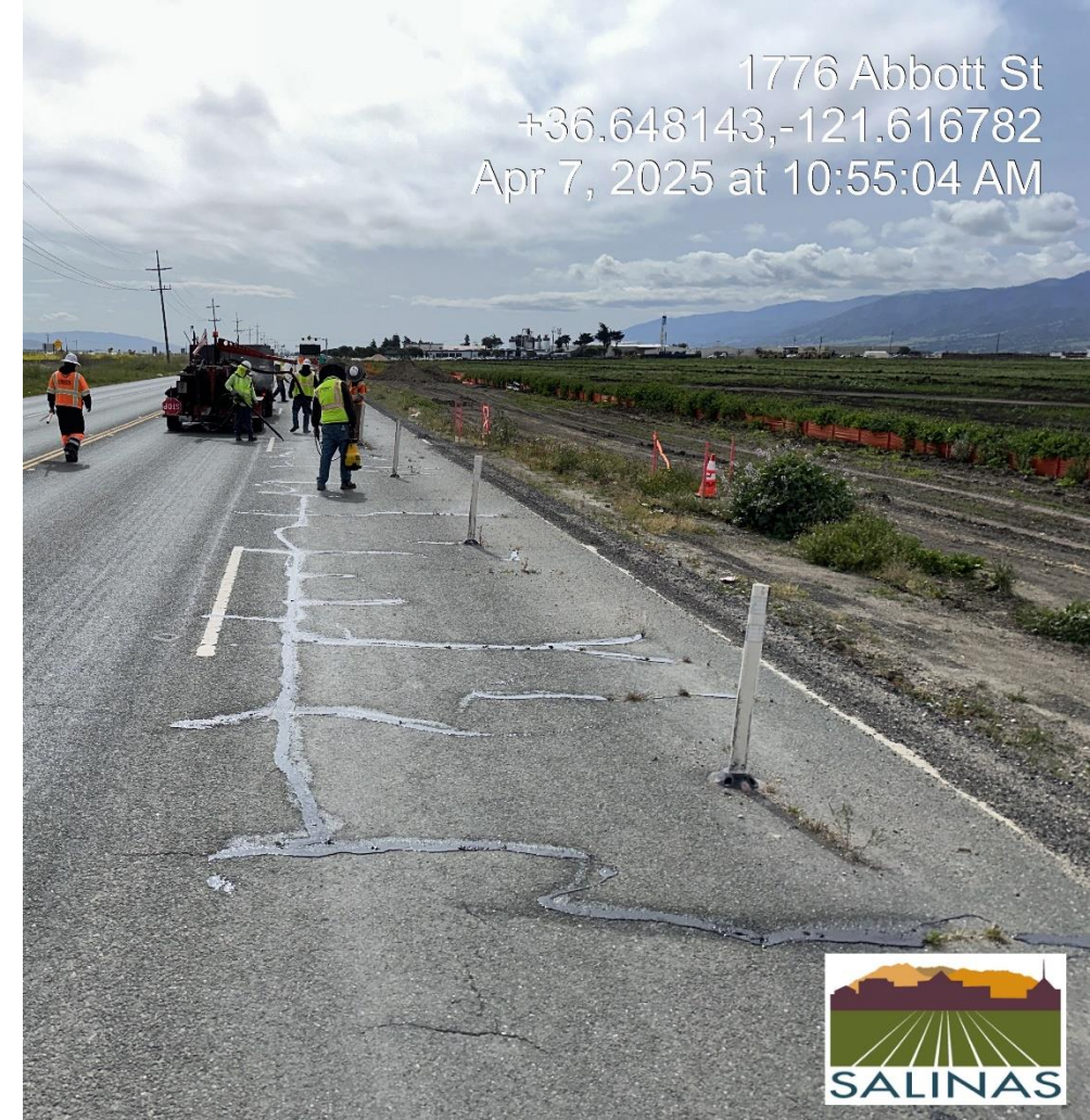
Crack Treatment Abbott St