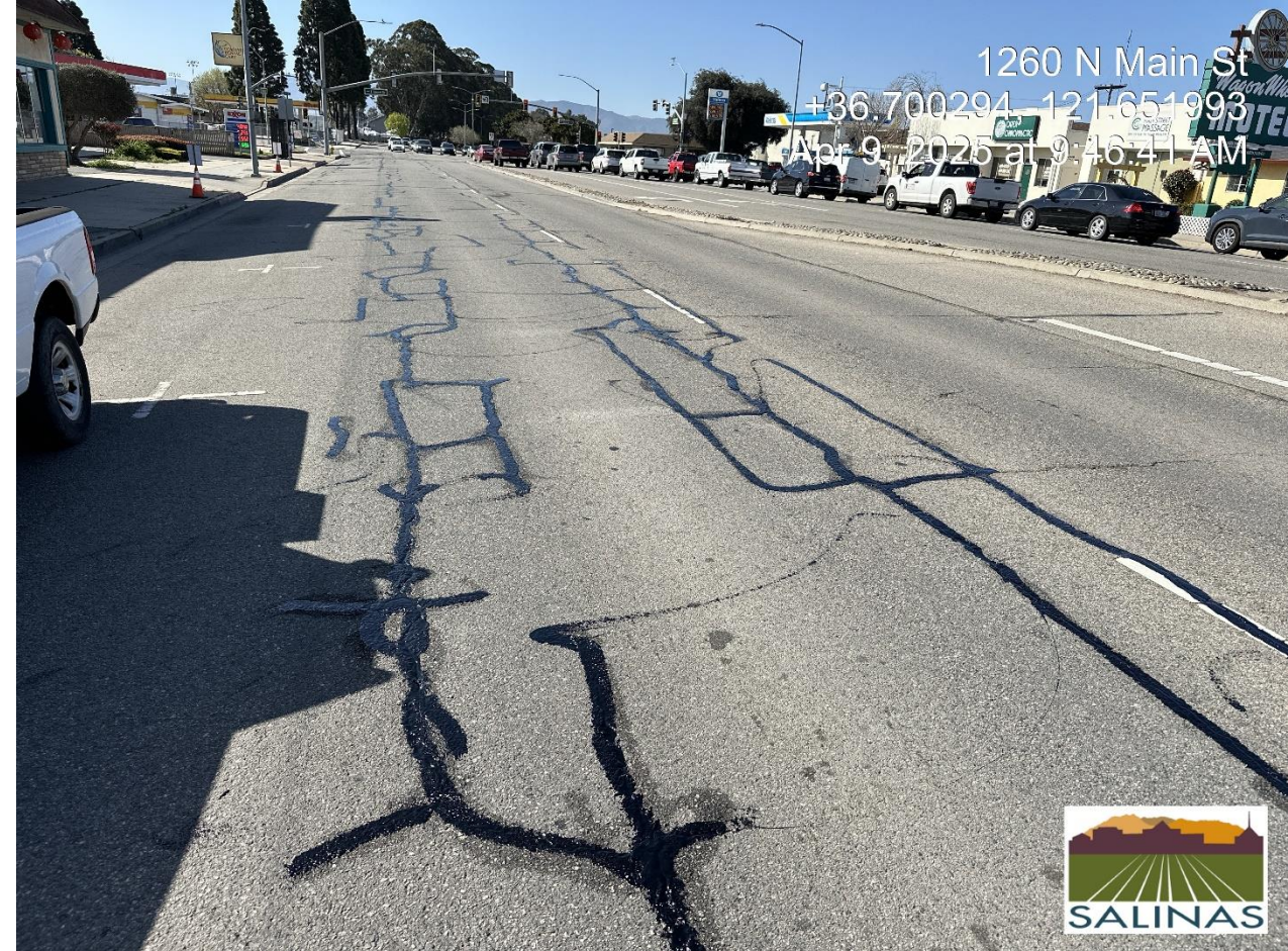
Crack Treatment – N. Main St.