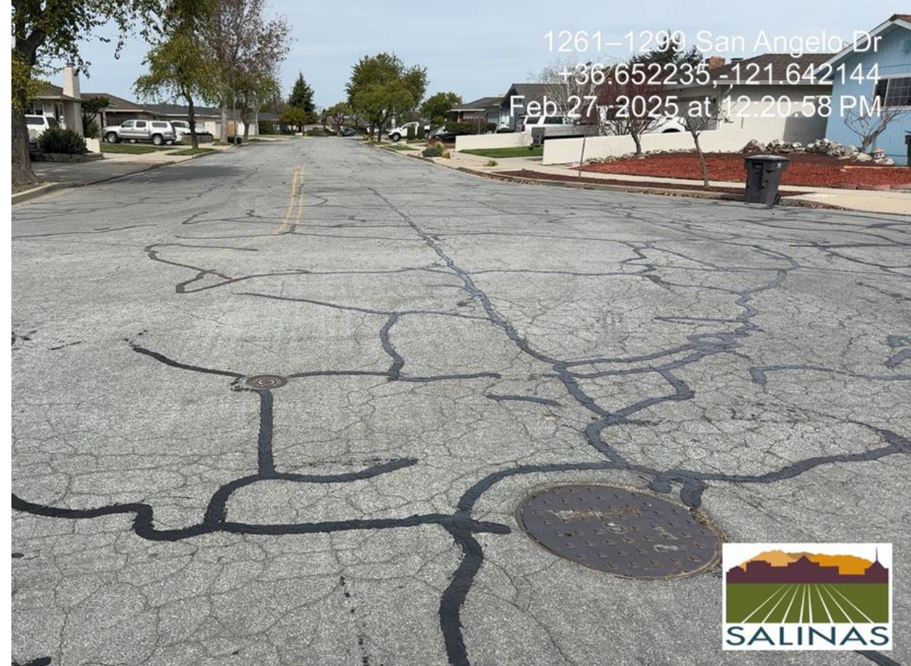
Crack Treatment Towt St & San Angelo Dr