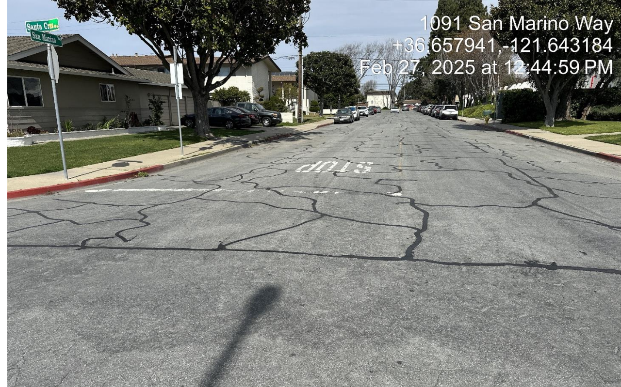
Crack Treatment Santa Cruz Ave. & San Marino Way