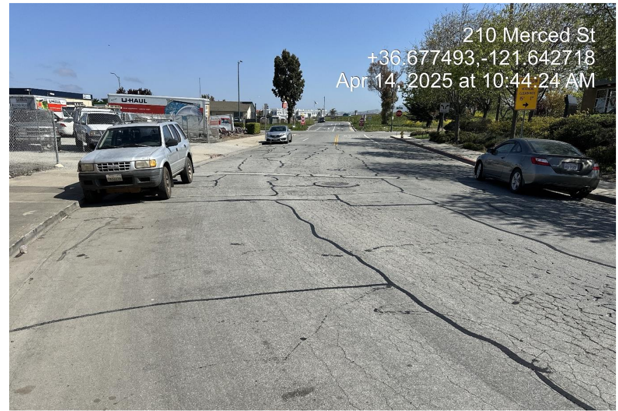
Crack Treatment – Merced St.