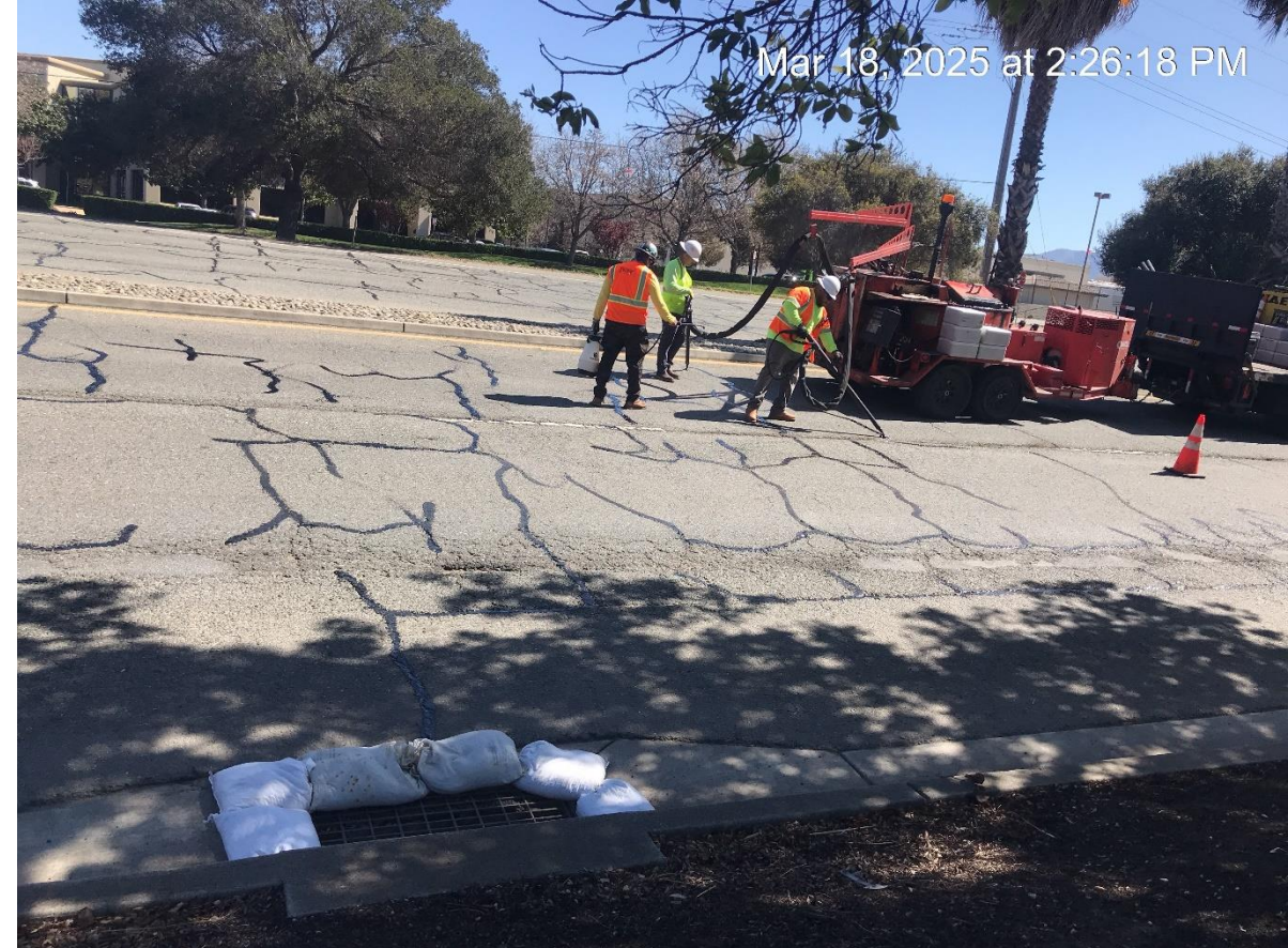
Crack Treatment E Blanco Rd