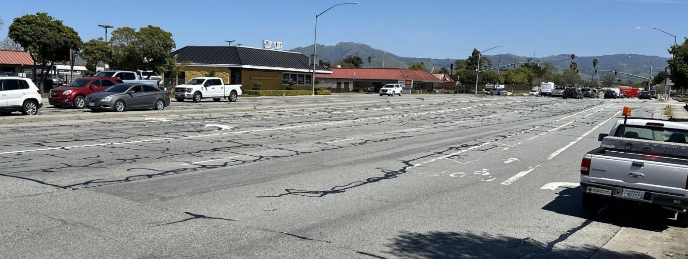
Crack Treatment Boronda Rd

Northridge Mall +36.721689,-121.657996 Apr 8, 2025 at 2:00:43 PM