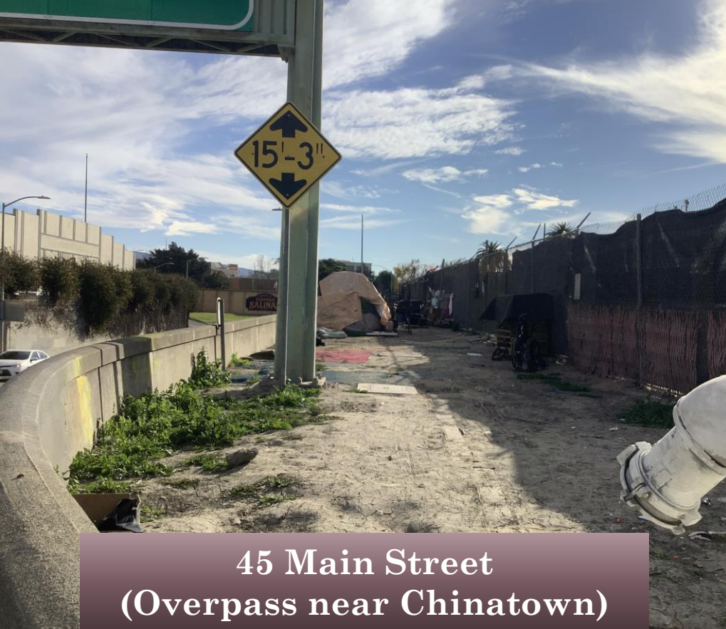
45 Main Street (Overpass near Chinatown)