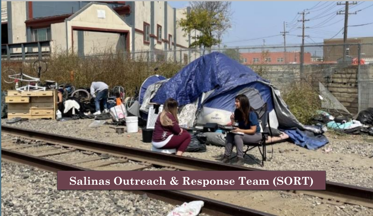
Salinas Outreach & Response Team (SORT)