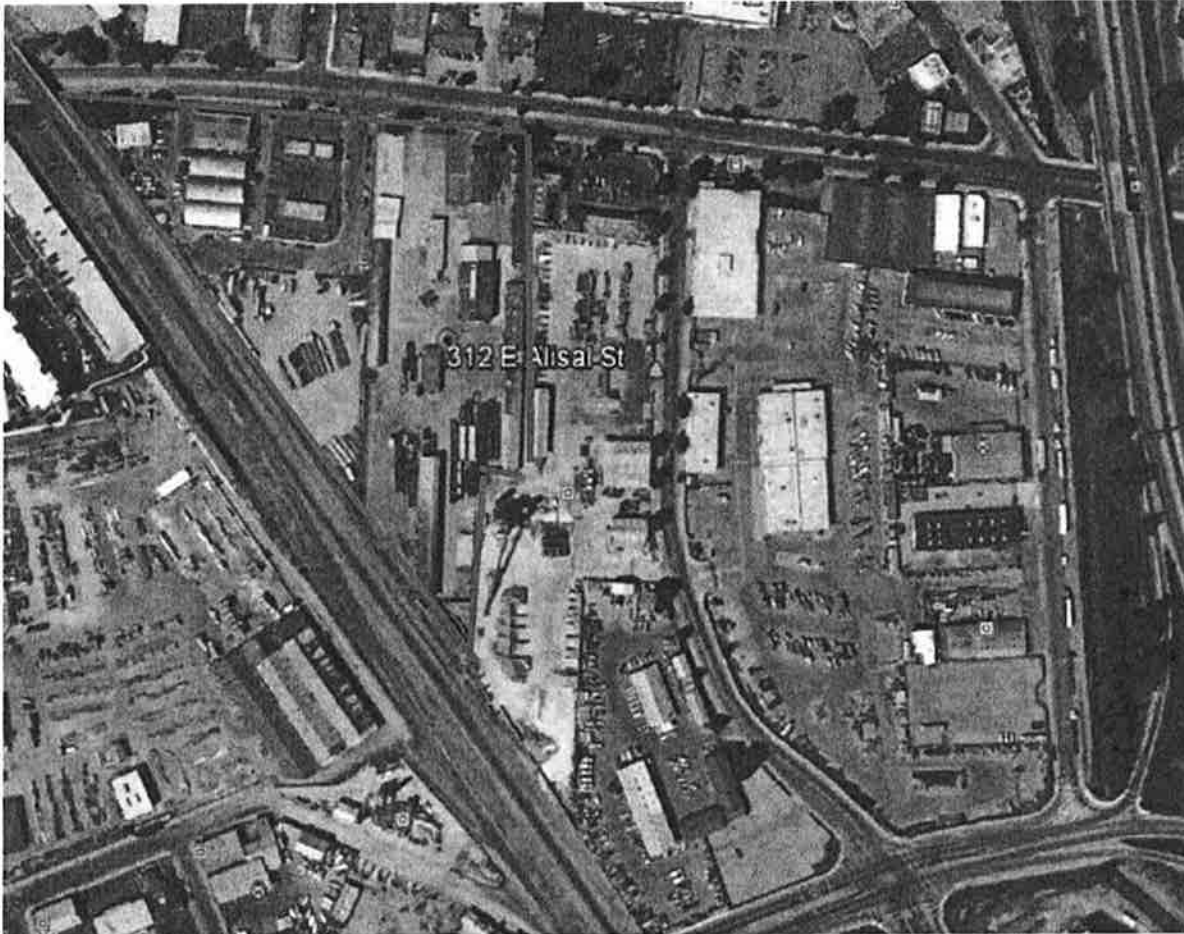
Parcel Map highlighting 312 East Alisal