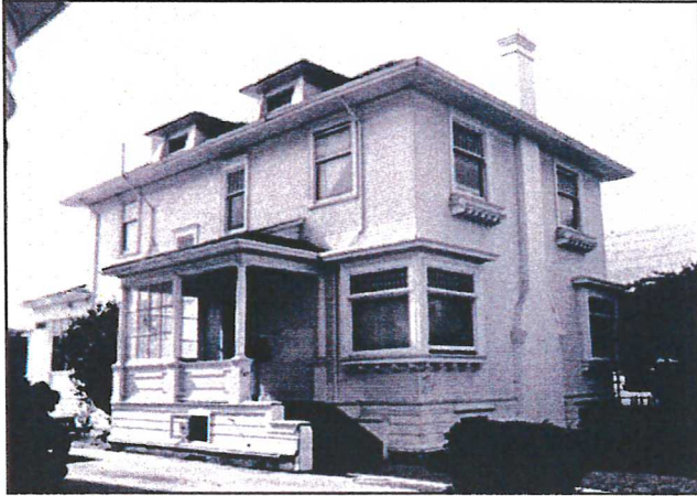
Figure 1. Circa 1988 image of the north and east elevations.