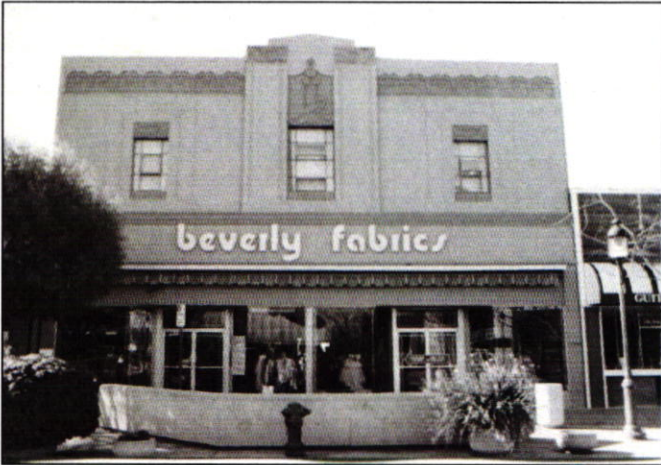
Figure 1. Circa-1988 image of the west elevation.