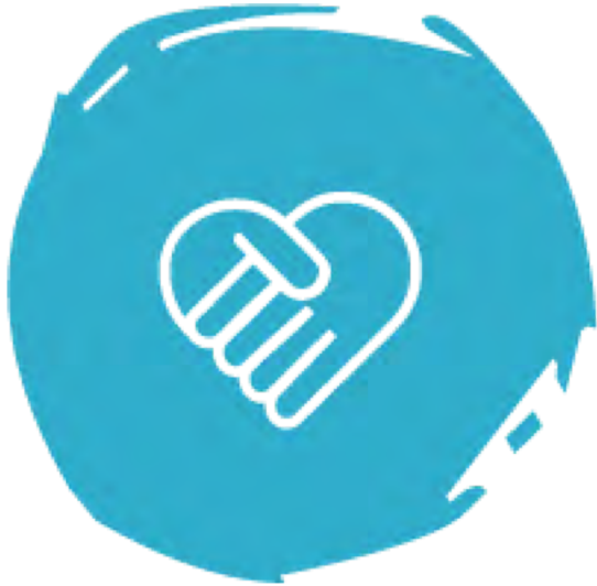
The Community, City Hall And Public Services