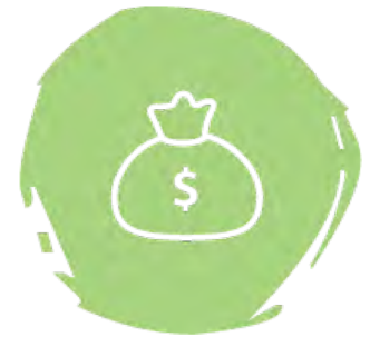
Taxpayer, Tourism And Small Business