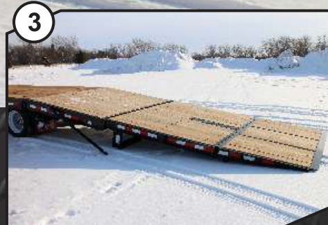
Finish lowering ramp for a low loading angle of approximately 9°.