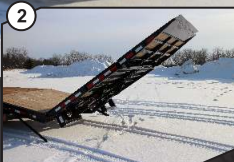
Raise tail section...