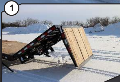
Simple operation. Lower ramp part way...