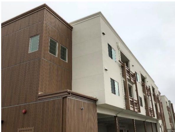
Haciendas Phase III (Hikari)