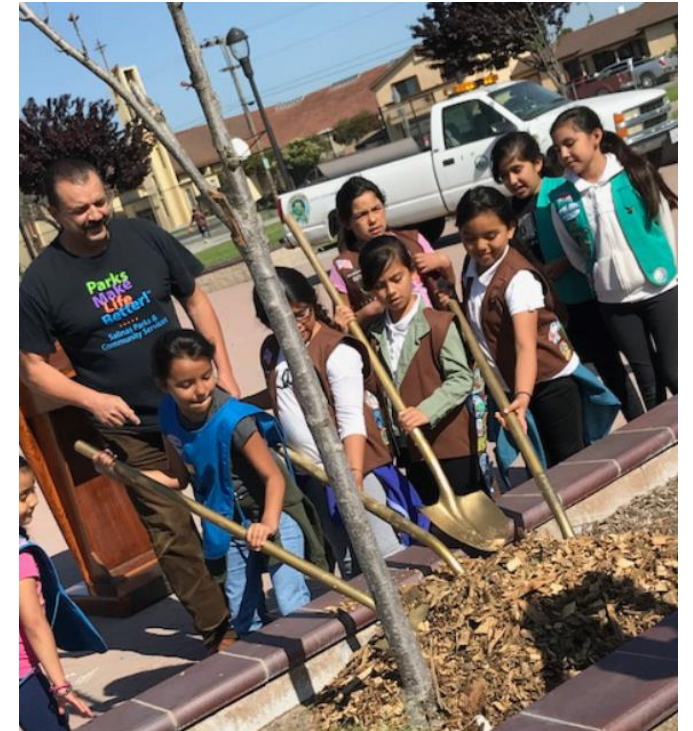
Girl Scouts (Alisal Program Center)