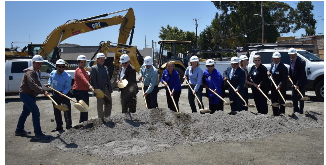
Moon Gate Plaza Groundbreaking