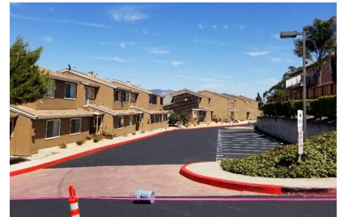
Vista De La Terraza