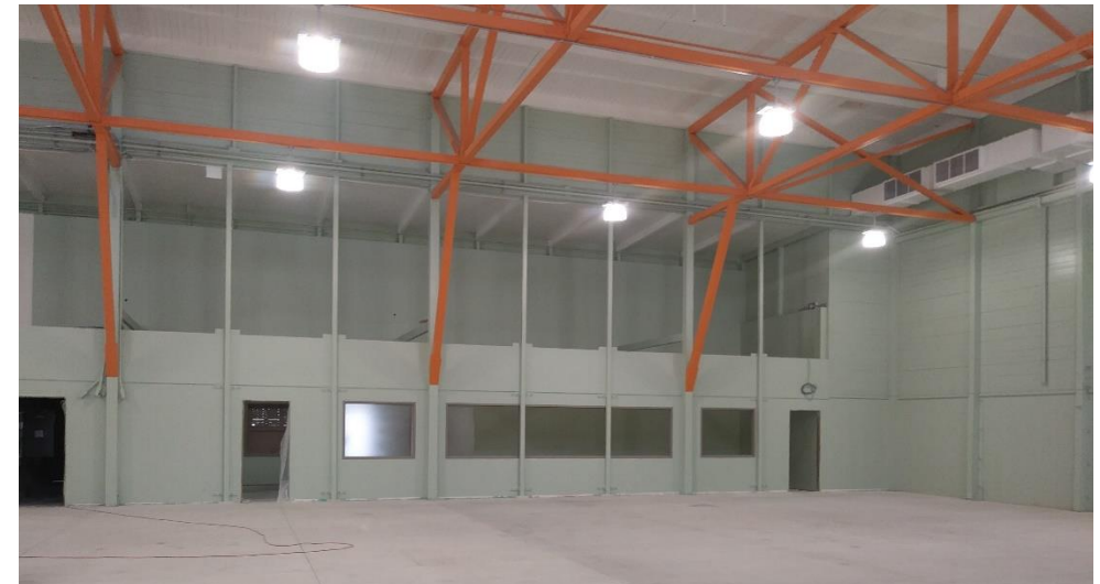
Figure 2: Future Exercise Room, Basketball and Volleyball Court