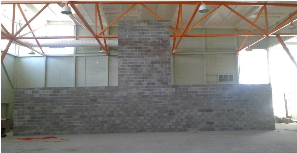
Figure 1: Future Basketball Hoop Wall