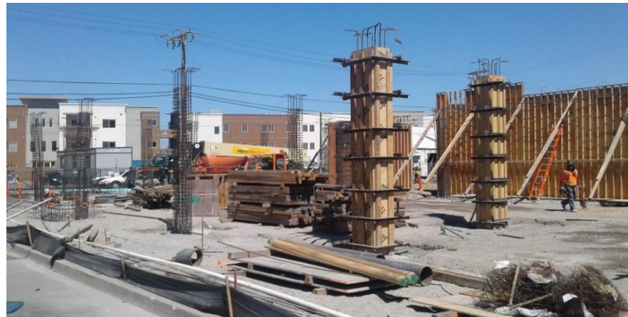
Moon Gate Plaza