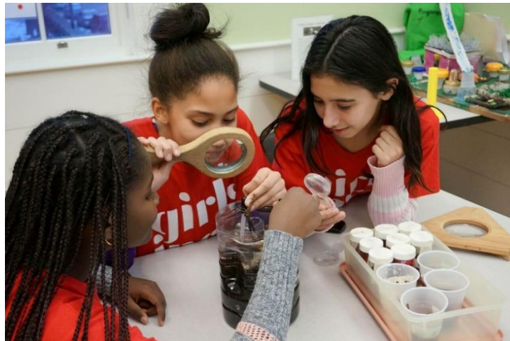
Girls Inc. (Leadership Development for Girls)