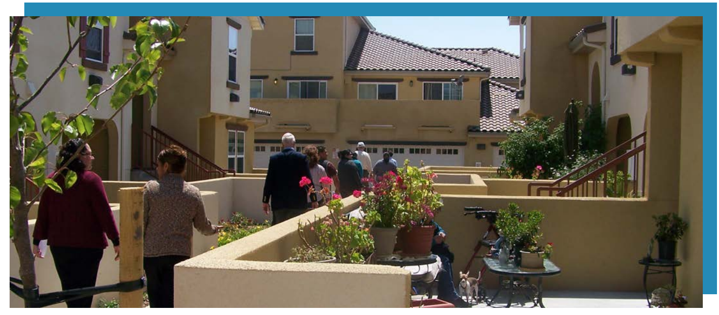
Affordable multi-family units at El Tresor in northern Salinas