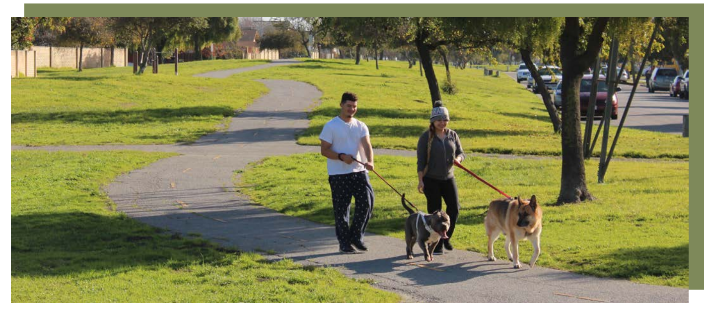
Dogwalking at the Rossi-Rico Greenway in west Salinas