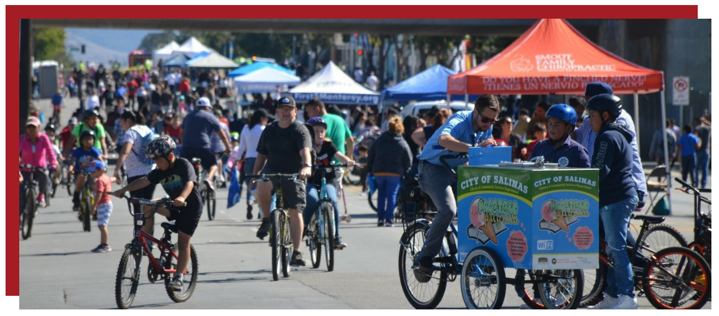
Ciclovía-an entirely youth-led event on Alisal Street in east Salinas