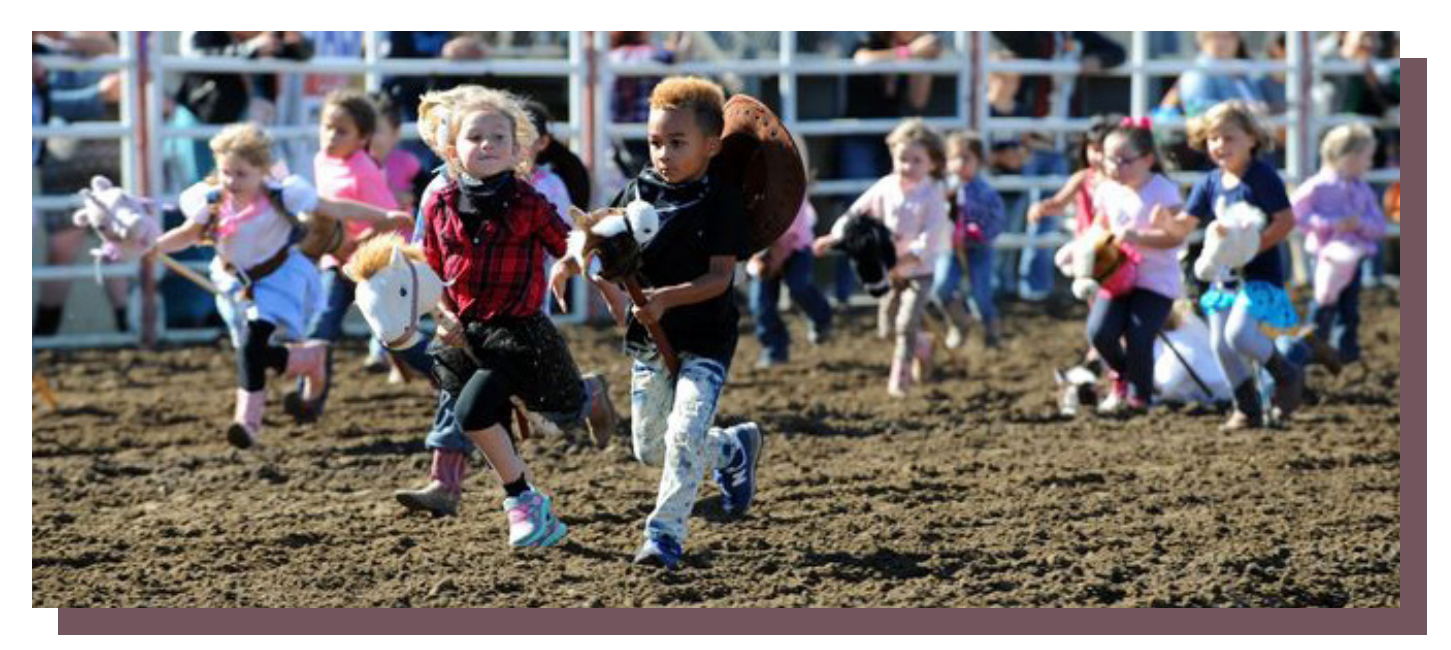
"Horsies" race at the California Rodeo, Salinas