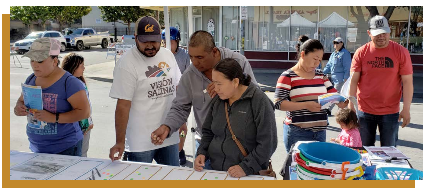
Alisal Vibrancy Plan Popup event at Ciclovía, 2018