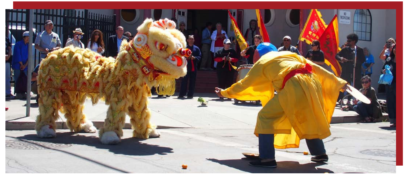
The Lion Dance at the 2017 Salinas Asian Festival in Chinatown