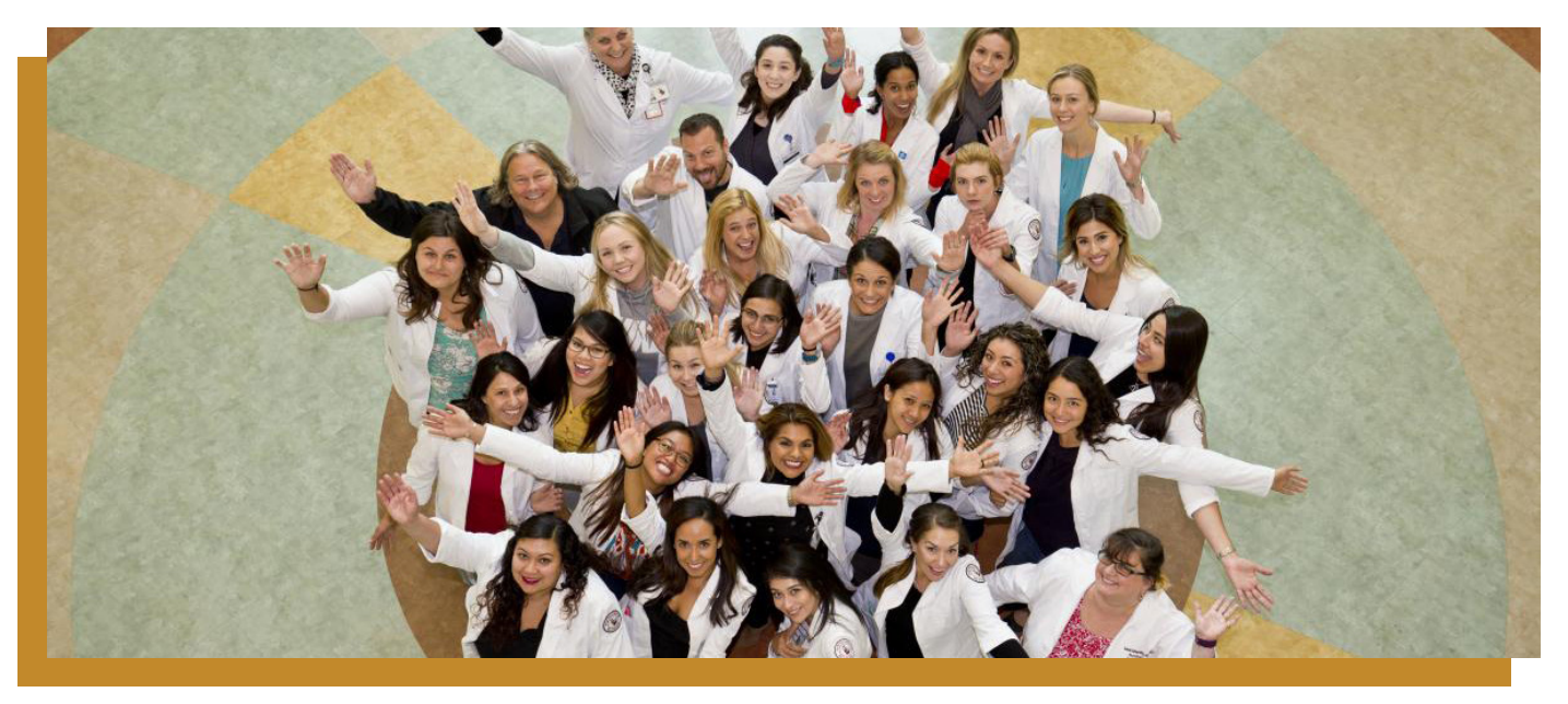
Nursing students' graduation at Hartnell College in Salinas