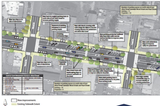
Figure 8.3 Conceptual East Alisal Street Improvements